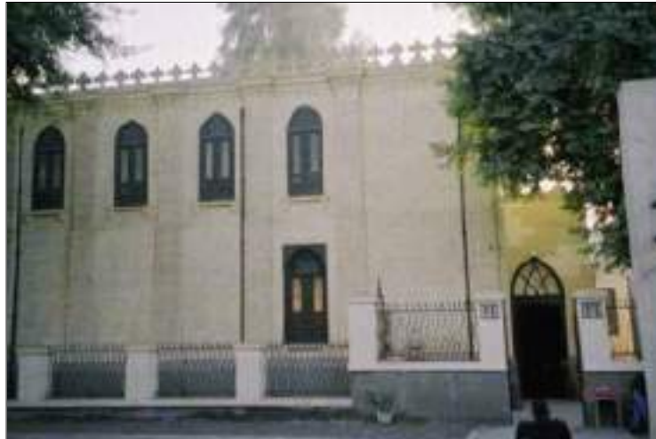
Ben Ezra Synagogue, Old Cairo.

The oldest surviving synagogue in Egypt was built in 882 CE and located in Old Cairo. It is known as the Ben Ezra synagogue. At the end of the 19 th century, an historian was able to remove for study an attic full of books and community records dating back to the 11 th and 12 th centuries, preserved by the characteristically dry climate of the region.