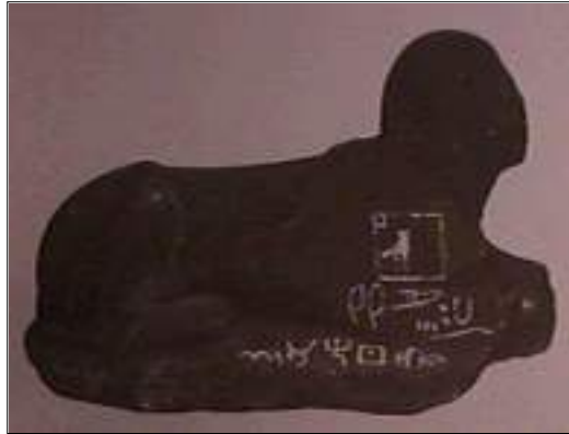
Sphinx discovered by Petrie at Serabit El Khadim.

On the west coast of the Sinai Peninsula - the great and terrible wilderness of the Exodus - at a place called Serabit El Khadim, the Egyptians mined turquoise. Turquoise is a semi precious stone found alongside copper ore. The workers in the mines were a Semitic people, perhaps contemporary with the Israelite sojourn in Egypt, although probably not including them given the nature of their religious practices. However, they spoke a language very similar to Hebrew. In 1905, Sir Flinders Petrie discovered several artefacts including the Sphinx pictured here. They were engraved with an alphabetic script and classical hieroglyphics, both stating the same message. A similar happy coincidence occurred with the famous Rosettastone (found at Rashid in Egypt by Napoleon's soldiers) which allowed scholars to work from the known Greek to the then undeciphered Hieroglyphics. It is believed the alphabet we use today had its origins in this so named proto-Sinaitic script. Scholars can trace its development through Greek, to the European Alphabets in use today. It became the basis of such widely different alphabets such as Sanskrit, Arabic, Cyrillic and Thai.