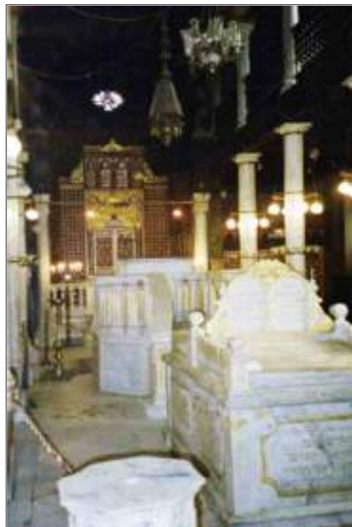
Ben Ezra Synagogue interior, with genizah visible in the background.