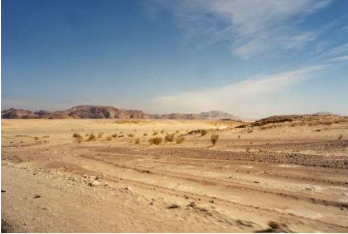
Somewhere on the road south of Dahab, eastern Sinai Peninsula...