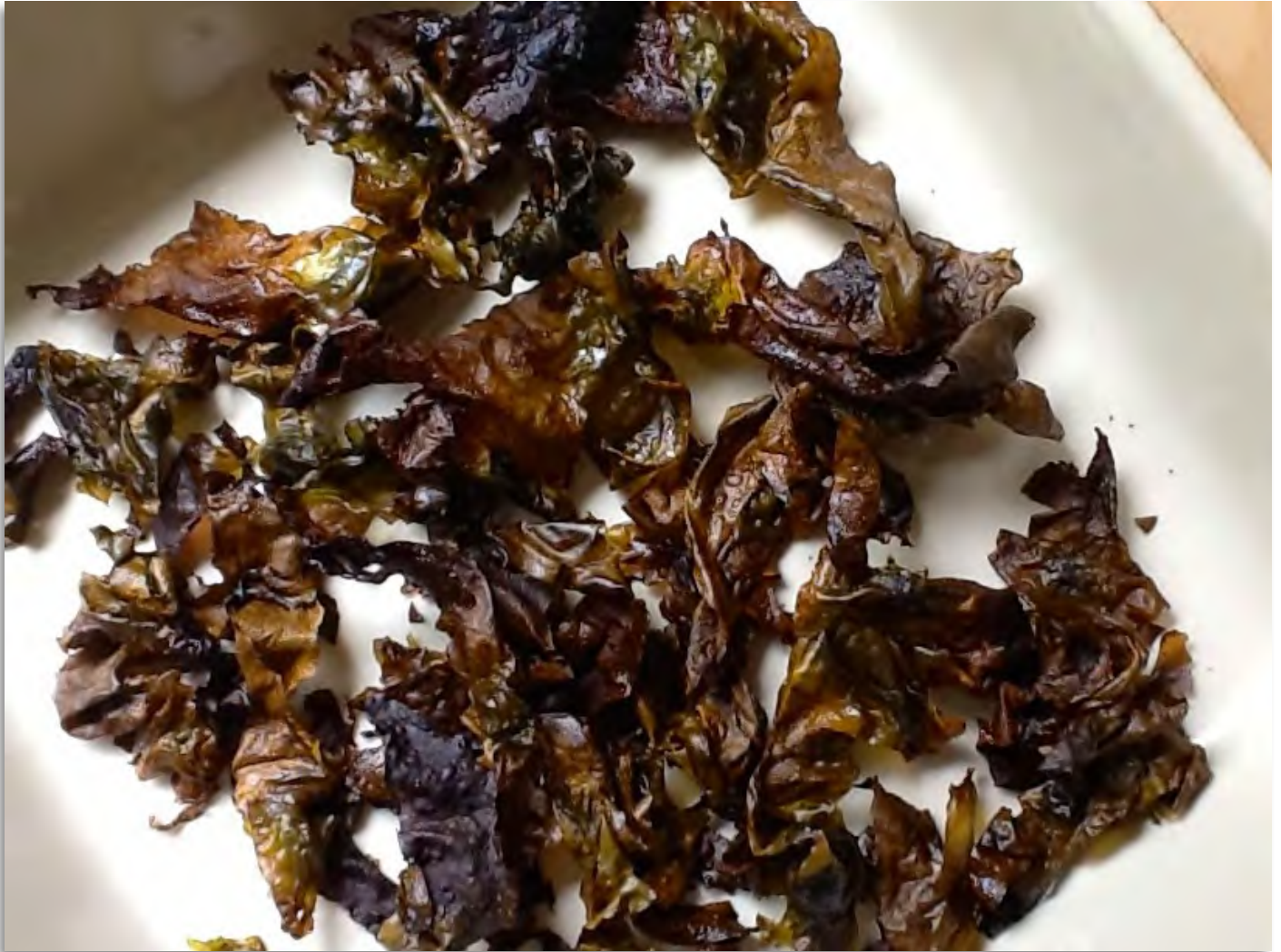
Roasted fresh Icelandic dulse seasoned and baked