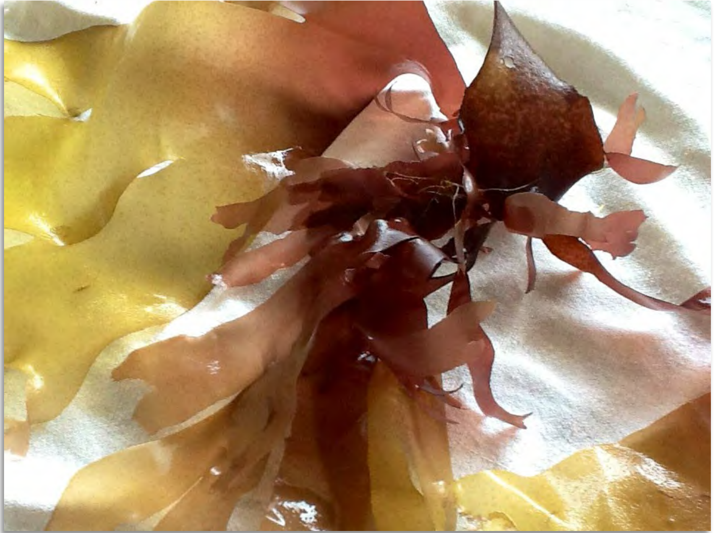
Fresh Icelandic dulse