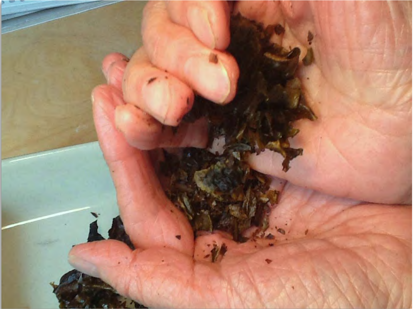
Crumbling roasted seaweed into crunchy flakes