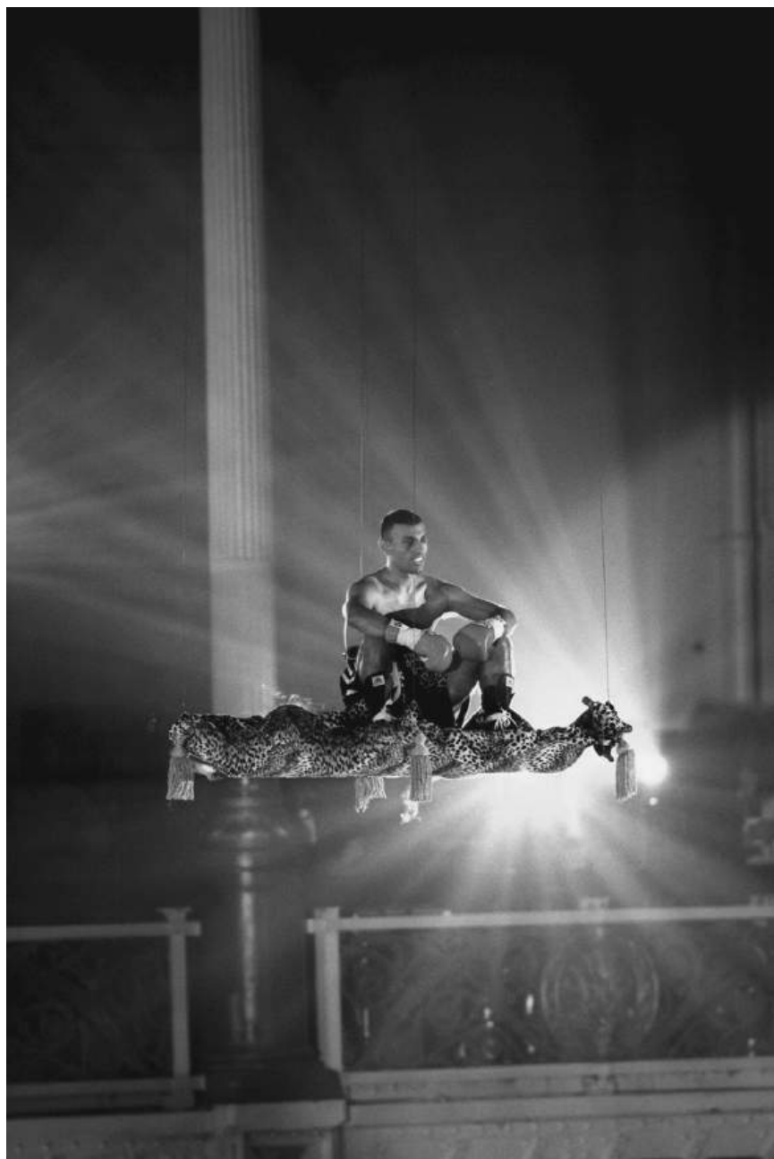
Figure 5.5 Magic shows: 'Prince' Naseem Hamed on the magic carpet