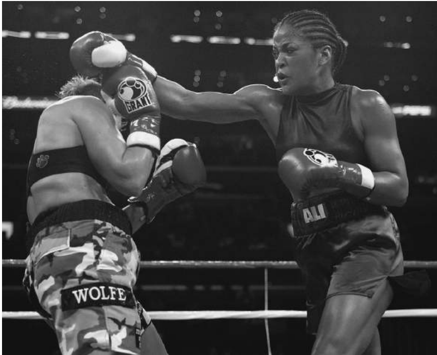
Figure 5.2 Laila Ali in action, 2003