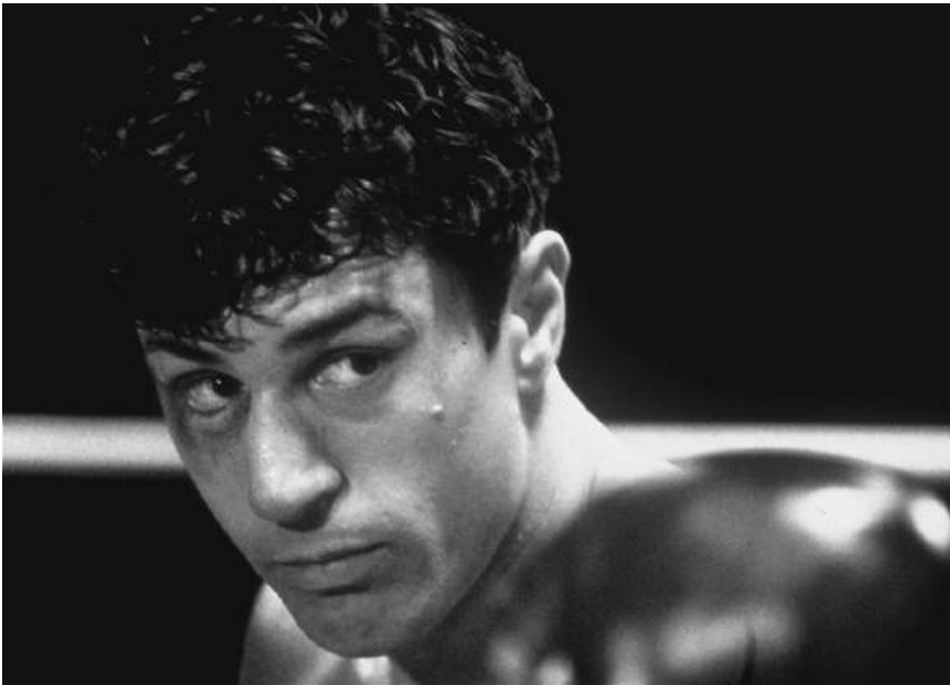
Figure 6.2 Robert de Niro in Raging Bull

Viewing aggression in the ring with its subtext of diverted sexual energy also involves the concomitant notion that the spectator is drawn into an eroticized pleasure in viewing. The problem of the representation of violence is compounded by the difficulties that beset reproducing violence. Scorsese resolves this through