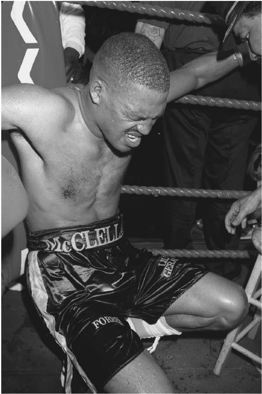
Figure 4.1 Broken body: Gerald McClellan in Benn versus McClellan, 1995