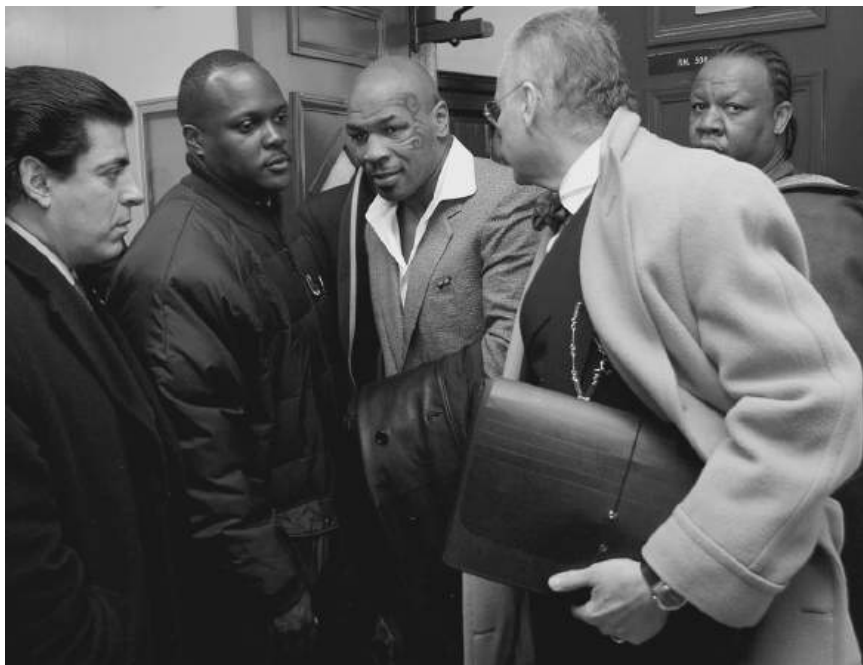
Figure 5.4 Tyson leaving court, again, 2004

reflected in that celebrity whom we might seek to emulate in their pugilistic endeavours. Boxing has its specificities and the notion of celebrity may be insufficiently robust to account for the identifications that take place among the practitioners of the sport. However, for some boxers of whom Muhammad Ali is one of the most well-known boxing figures, it is possible to be both a hero and a celebrity.