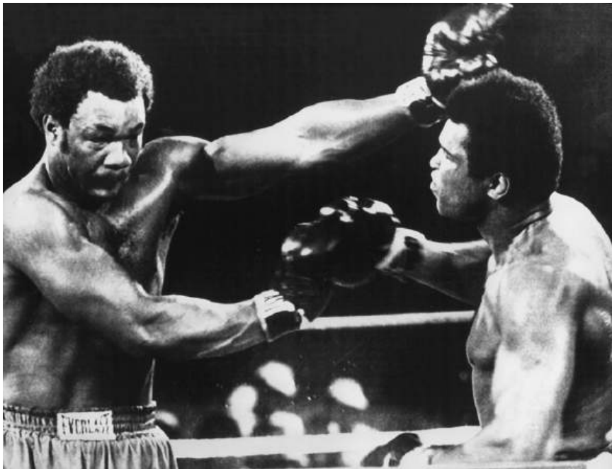
Figure 3.1 'Rumble in the Jungle'

'Good stories' take different forms and, in boxing, also relate to the big moments of major contests. Mailer's account of the 'Rumble in the Jungle' in 1974 from which an extract is quoted at the start of this chapter, is such a boxing moment,