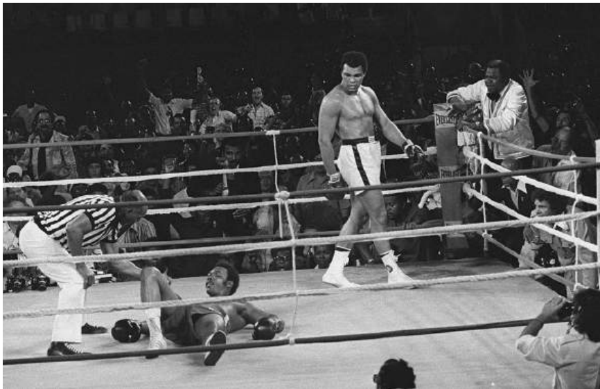
Figure 5.1 The ring as frame, Kinshasa, 1974

The ring is crucial to the setting of the visual narrative of boxing and this image of the famous Ali–Foreman fight in Kinshasa Zaire in 1974 has become