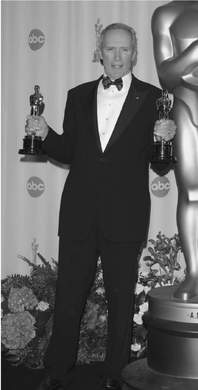
Figure 6.3 Clint Eastwood at the Oscars