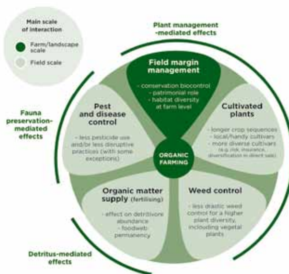
Figure 1: Main Organic Farming design factors and practices likely to promote and preserve biodiversity in agroecosystems.

and biodiversity through many different processes (Fig. 1). Cropping systems designed in organic farming (Zehnder et al., 2007) can therefore be considered as prototypes to preserve and promote biodiversity in agricultural areas.