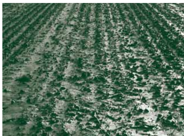
Photographs: (Andreas Fliessbach, Nov. 2002): Accumulation of organic soil matter as adaptability to extreme rainfall using the example of DOK long-term field experiment in Therwil/CH; Above: parcel of bio-dynamic cultivation system (only organic fertiliser); Below: parcel of integrated cultivation system (only mineral fertiliser).