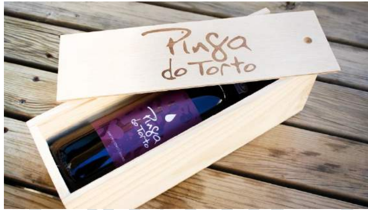
Calligraphy on the box & bottle of limited edition perfume

Because calligraphy is done by hand, it expresses emotion very well. Used in a brand mark or in advertising, good calligraphy can give the user something that technology can't provide: the human touch. But it will always be available in limited edition.