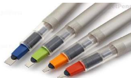
Set of Calligraphy pen