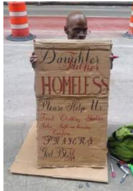
Message for the passers by

You can also use the power of calligraphy for creative and personal uses. Through beautiful calligraphy, you can draw attention of viewers for your messages. Definitely shows the power of calligraphy to go beyond like graffiti writing.