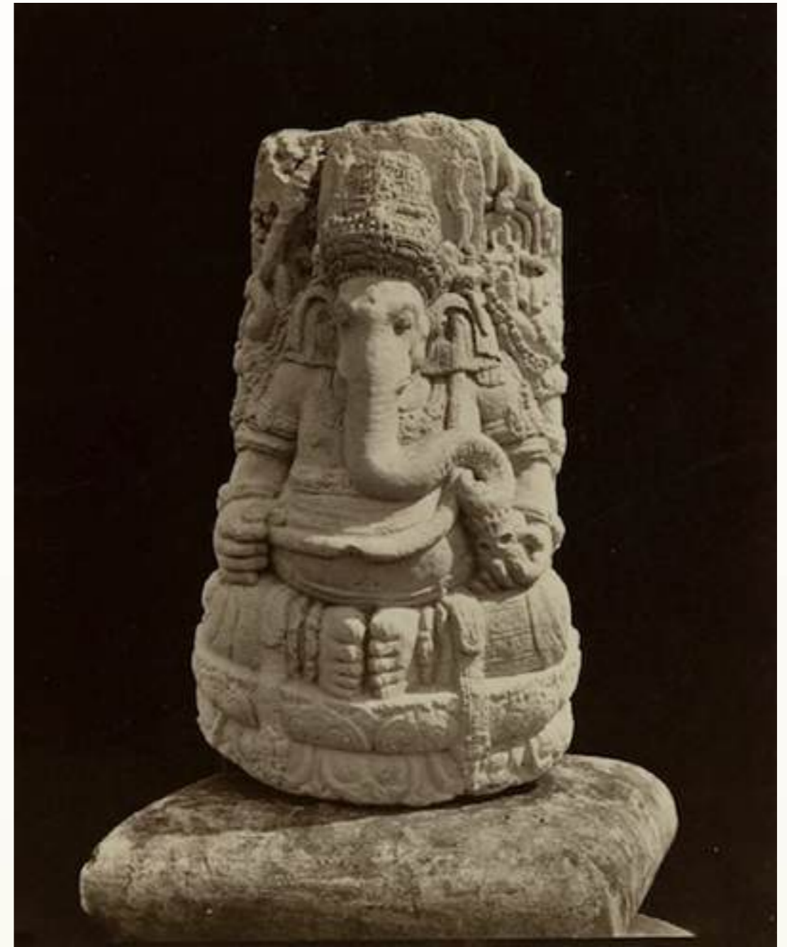
"Sculpture of Ganesha from Tjandi Parikesit on the Dijeng plateau, moved to the Museum of the Batavian Society of Arts and Sciences in Batavia."