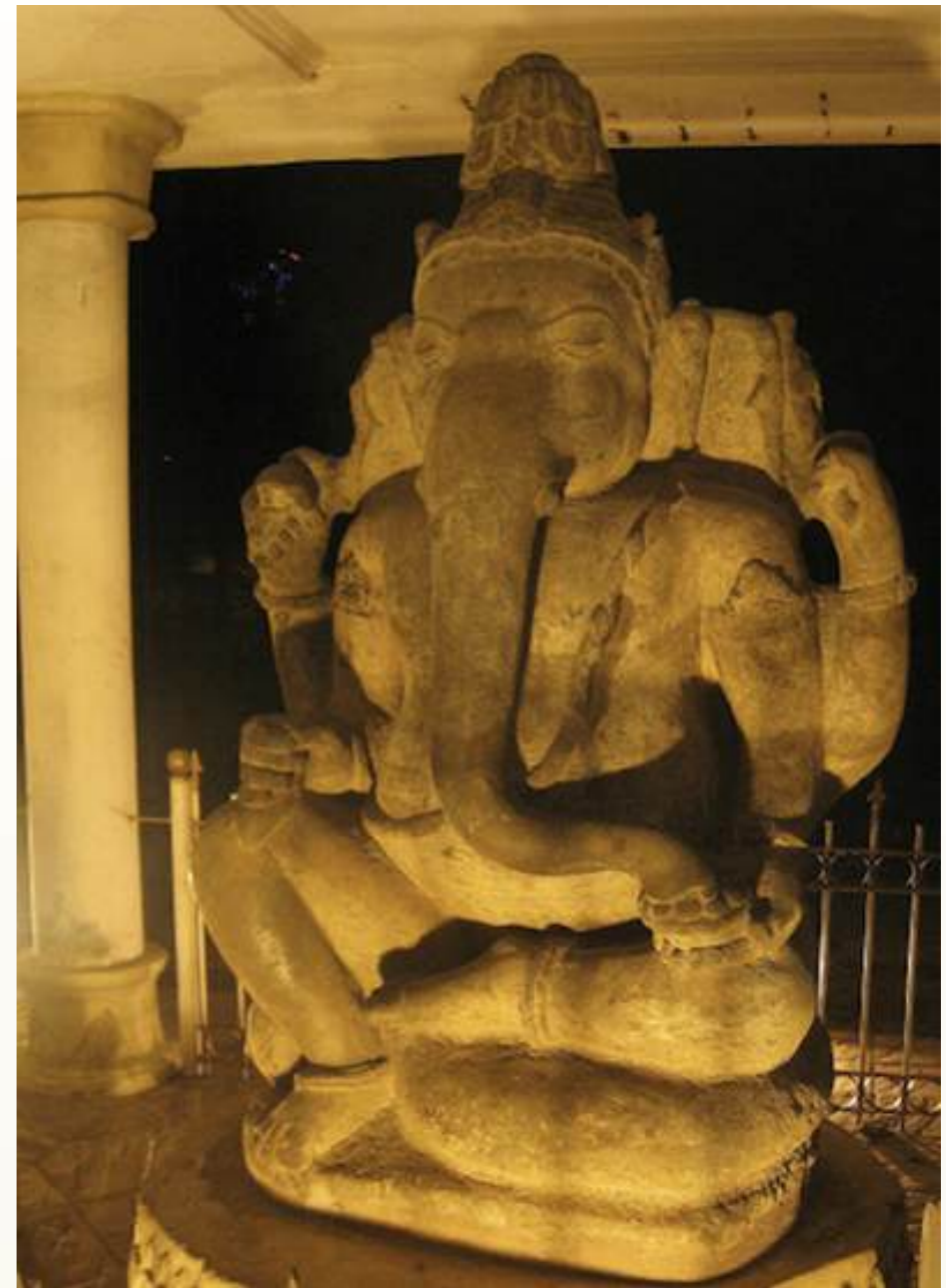
"A Ganesha statue in Sultan Mahmud Badaruddin II Museum Palembang. The statue was discovered in Pagaralam site, Jalan Mayor Ruslan, Palembang, South Sumatra. Located around 500 meters north of Angsoko temple ruin. The statue 175 cm tall and 110 cm wide was estimated originated from 9th century."