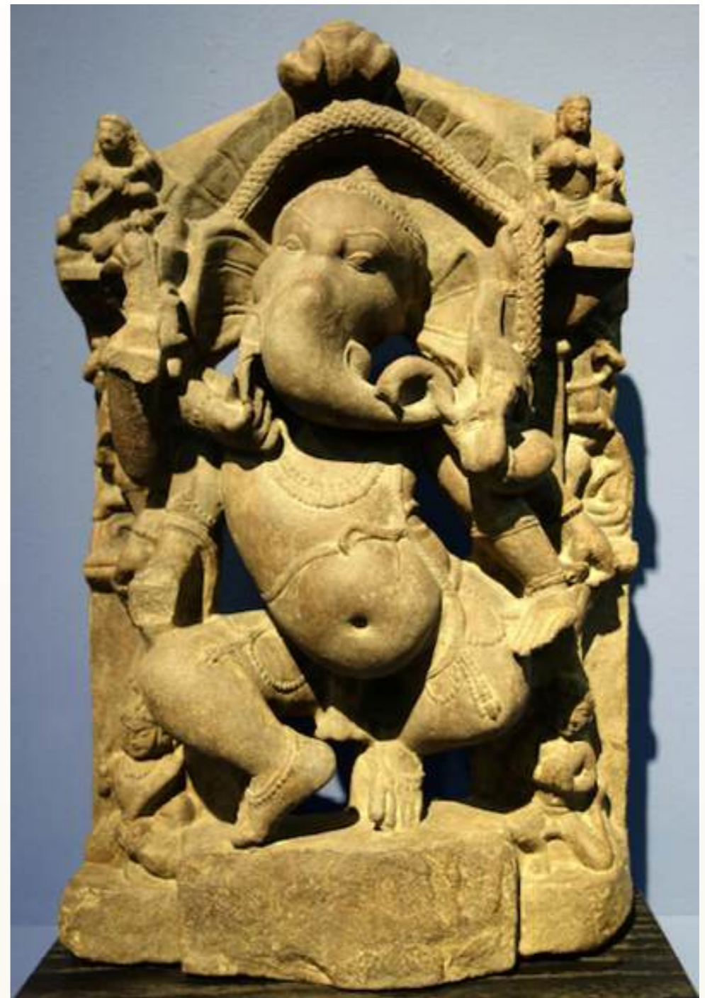
"Dancing Ganesha, India, 900-1000 AD, sandstone - Fitchburg Art Museum."