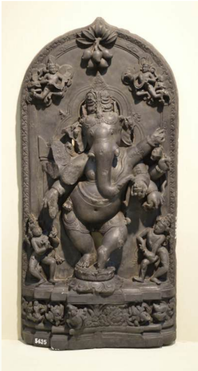
"Dancing Ganesha Black Stone Circa 12th Century CE Gangarampur West Bengal ACCN 5625-A25203 Indian Museum Kolkata 2015-09-26 3901."