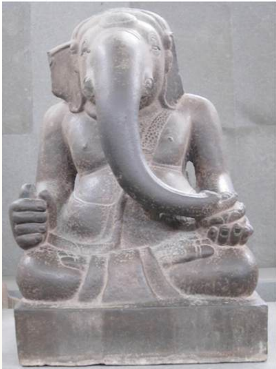
"Ganesha, sandstone, 7th-8th century, Museum of Cham Sculpture." "7th- to 8th-century Ganesha sculpture from Cham dynasty, Vietnam."