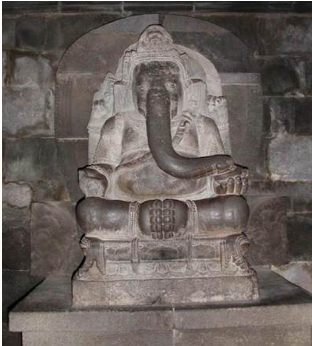
"The Ganesha statue, at Prambanan Temple, Java, Indonesia." "9th century."