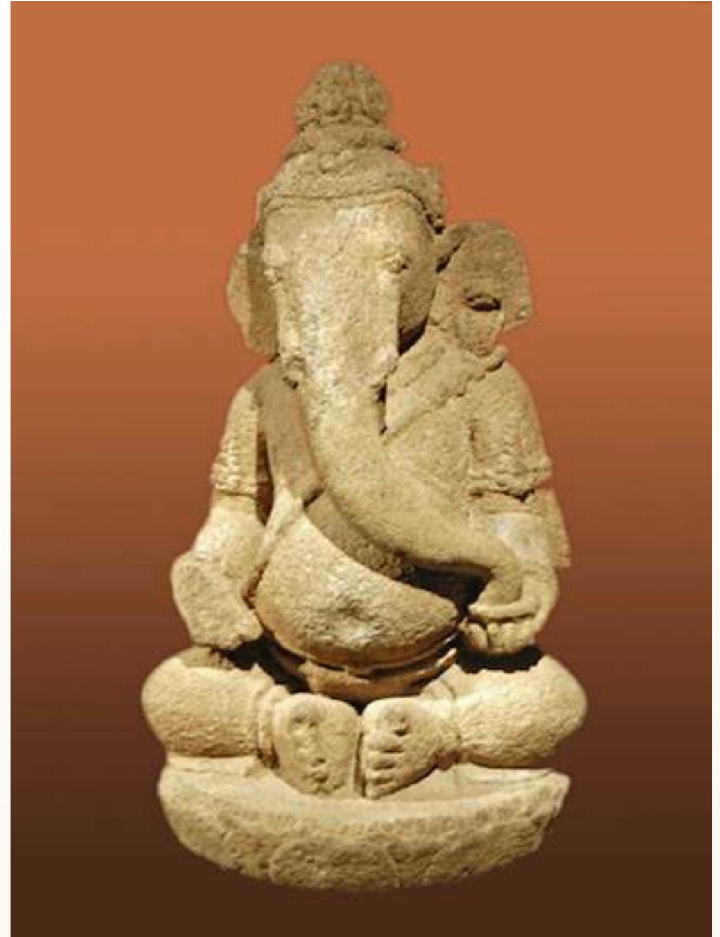
"Ganesh (Ganesha) Est de Java, Kediri 11ème siècle après J.C. Pierre volcanique 58,0 par 32,0 cm Musée d'art asiatique de Berlin (Dahlem)."