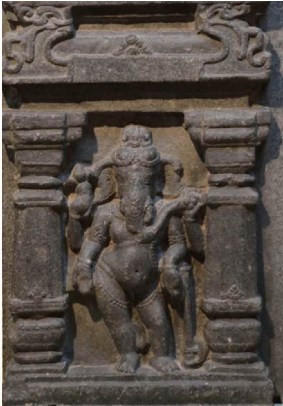
"Ganesha Black Stone Circa 11th Century CE Bihar ACCN A25162 Indian Museum Kolkata."