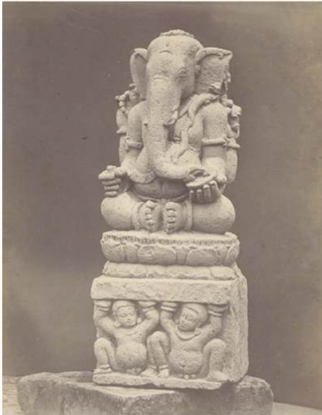
"Sculpture of Ganesha."