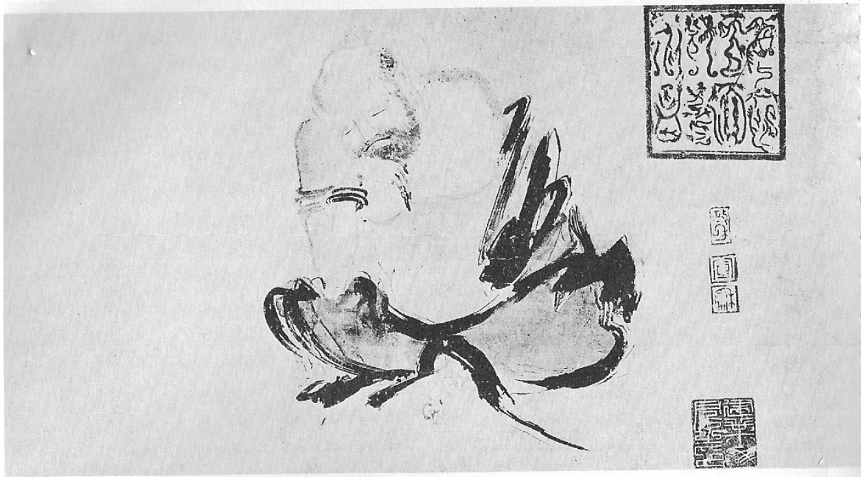
A Zen Master in Meditation, Shi K'o (Sekkaku). 10 th Century