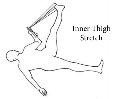
Open stretch. Keep hips on floor.