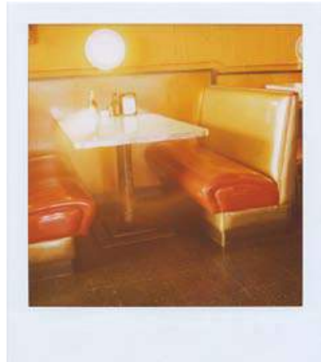
Cory Verellen, LandCameras.com

Avoid extreme behavior. As the sign of extremes, you may drown your emotions in unhealthy behaviors, like over-eating, substance abuse or worse. You can't stuff down your emotions with chocolate, or wash them away with adult beverages. If you find yourself going to dangerous places, get help. Call an anonymous helpline (Scorpios are secretive), join a support group, pore through self-help books.