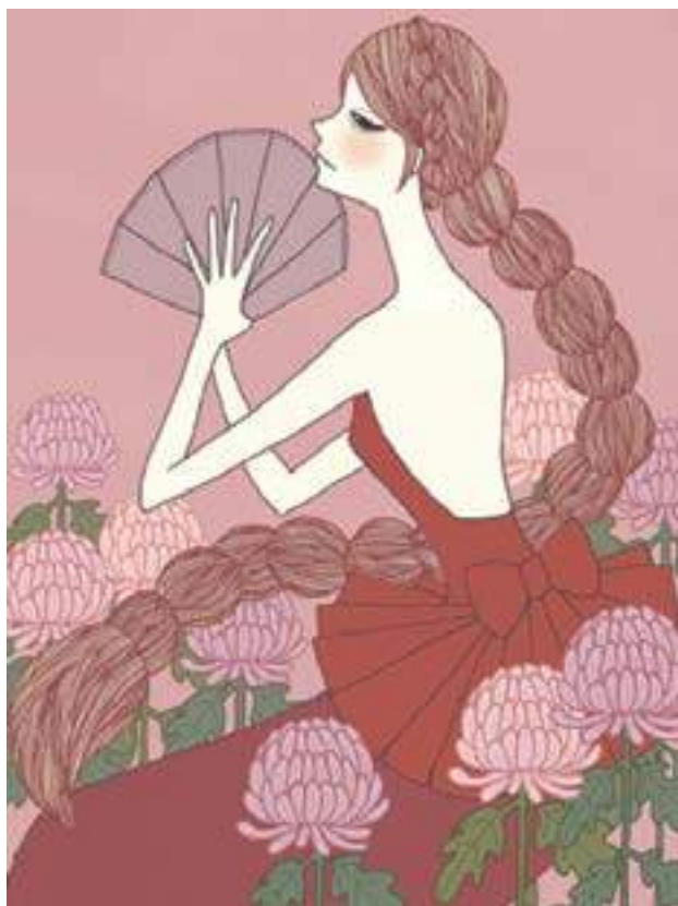
Illustrated by Yoko Furosho

Sure, you're intense, Scorpio, but few can resist your allure and charm.