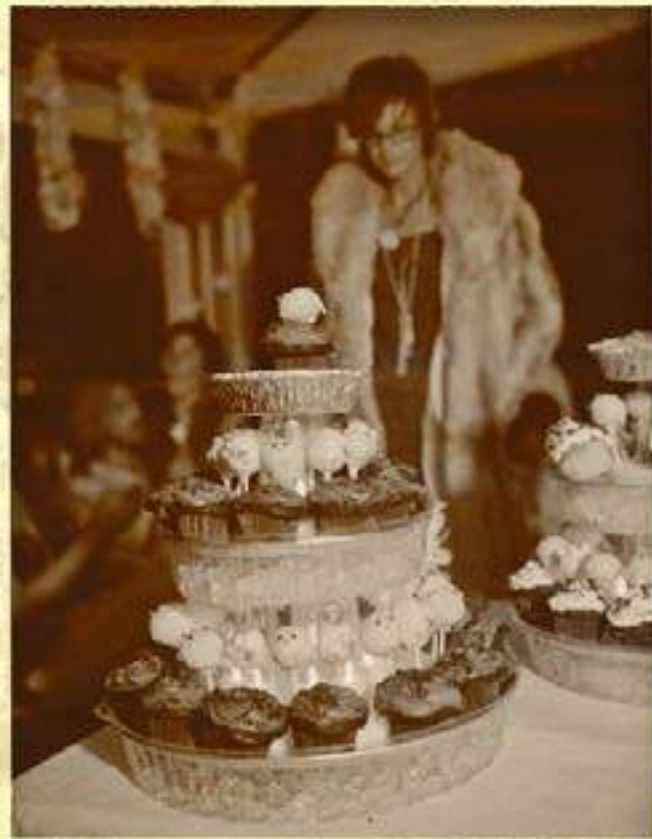
Cory Verellen, LandCameras.com

Since you warm up slowly in a crowd, try a dress-up theme or another icebreaker to get things rolling. You may even want to incorporate a musical performance or a roundtable political discussion into your parties, especially if you lead it. This allows you to hold court and display your power and intellect. You go to extremes to impress your guests and show them how important, worldly and accomplished you are. If you host a dinner party, you'll prepare detailed or exotic dishes, paying attention to the littlest touches and adding plenty of spice.