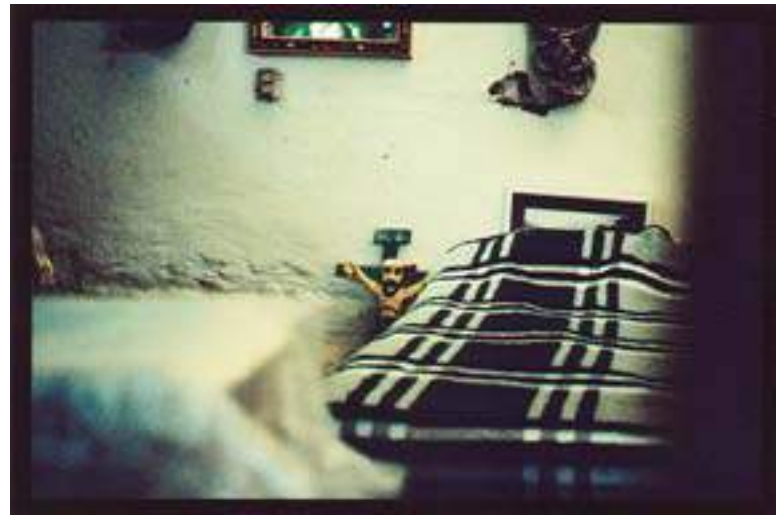
Cory Verellen, LandCameras.com

Your best vacation spots include water, your ruling element—such as a beautiful, remote beach where you can forget your troubles. Equally, you'll seek intense experiences like detoxing in Thailand, a long ski trip, or traveling through Europe by rail. Places that allow you to disappear into the crowd or explore the mysteries of a new culture or environment will appeal. You do well on retreats, especially at exclusive enclaves where you have plenty of privacy. Deep Scorpio always pursues intimate bonding (with yourself and others) and you don't want crowds or tightly-packed itineraries taking up your precious time. You prefer to be in total control of your agenda.