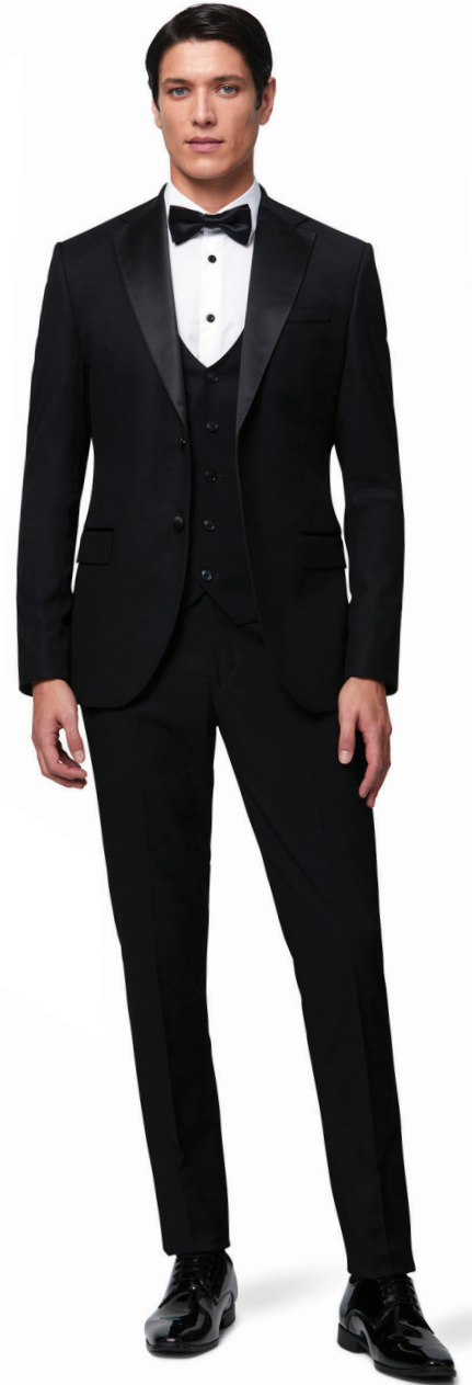
Edina Black Tuxedo