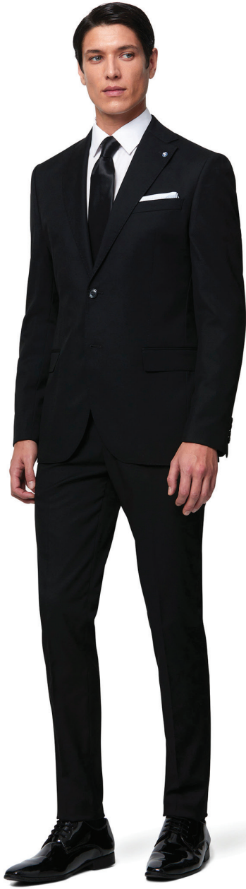
Edina Black 2PC