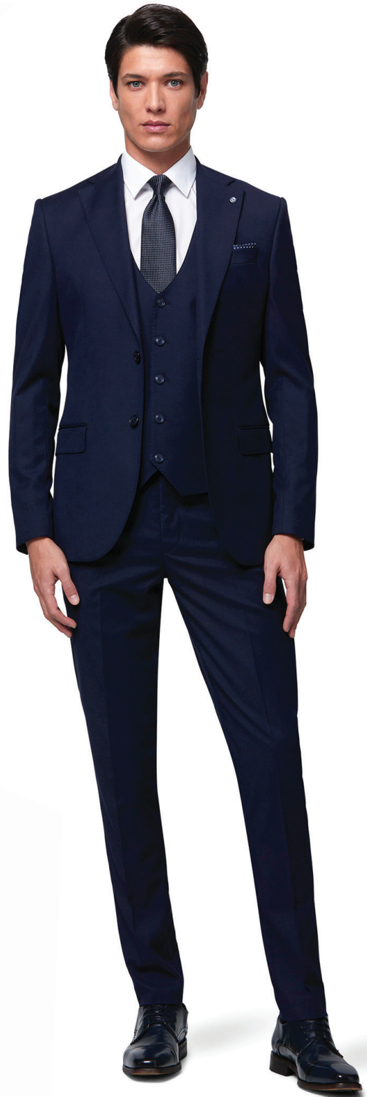
Edina Navy 3PC