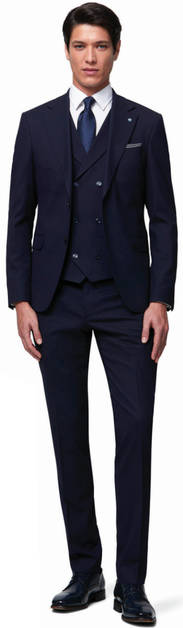
Double Breasted WC