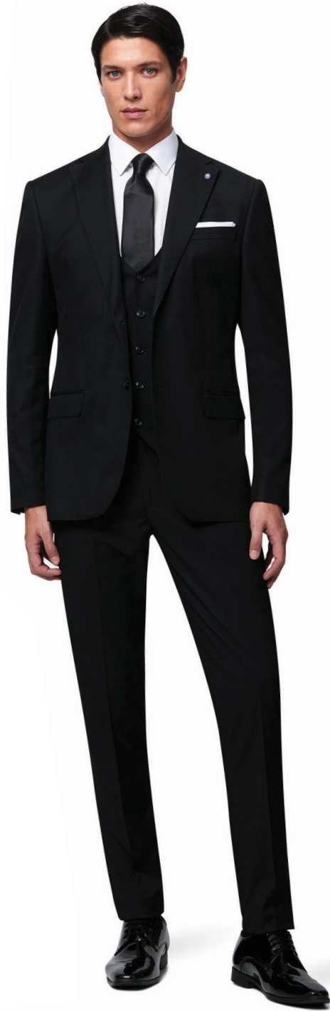
Edina Black 3PC