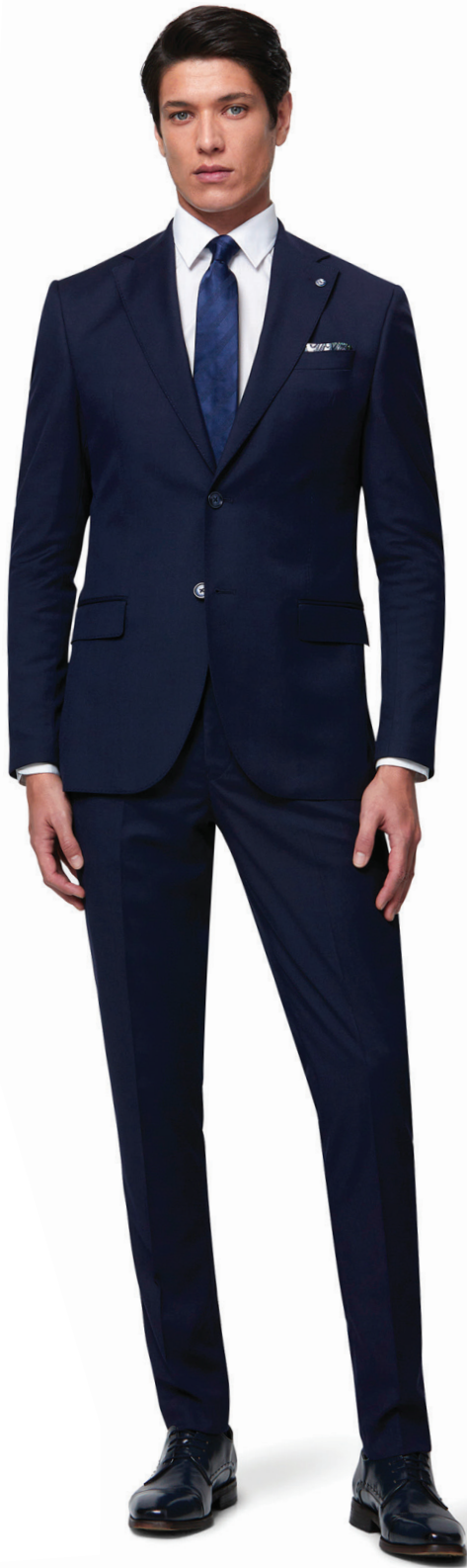
Edina Navy 2PC