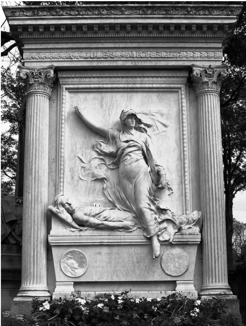
Fig. 1. Tomb of Jules Michelet by Antonin Mercié, Père Lachaise cemetery, Paris.