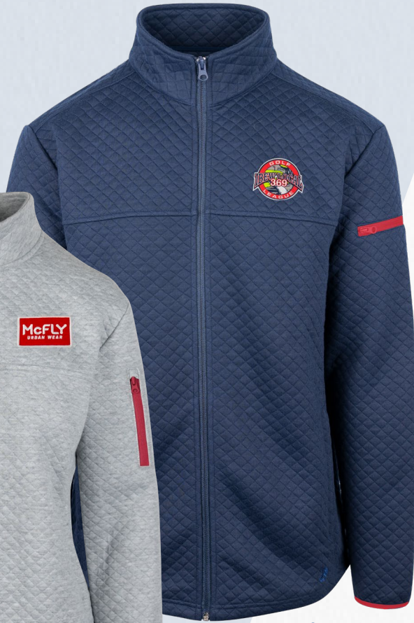
TRAVIS 1/4 ZIP (M)