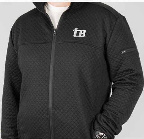
EXAMPLE OF DOMESTICALLY DECORATED BLANK TRAVIS

CRAFTED FROM MEDIUM WEIGHT, TRI-LAYER QUILTED FABRIC (95% POLYESTER + 5% SPANDEX, 345 GSM)