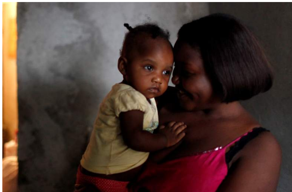
Above: Haiti. Woman at home with her daughter.

Accessibility in the context of marriage, family and property rights is paramount, because women may face the double burden of lack of financial resources to access the justice system and lack of child and/or spousal maintenance and alimony (see Figure 2.2). In some instances, women claimants may also be survivors of violence, and in this context, may need to access multiple points across the justice chain. To address the potential challenges of navigating the justice system, streamlined processes and procedures