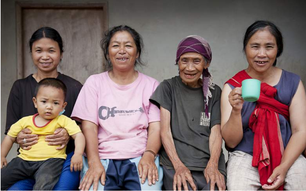
Above: Thailand. A family of women at Mae Salong, H'mong hill tribes.