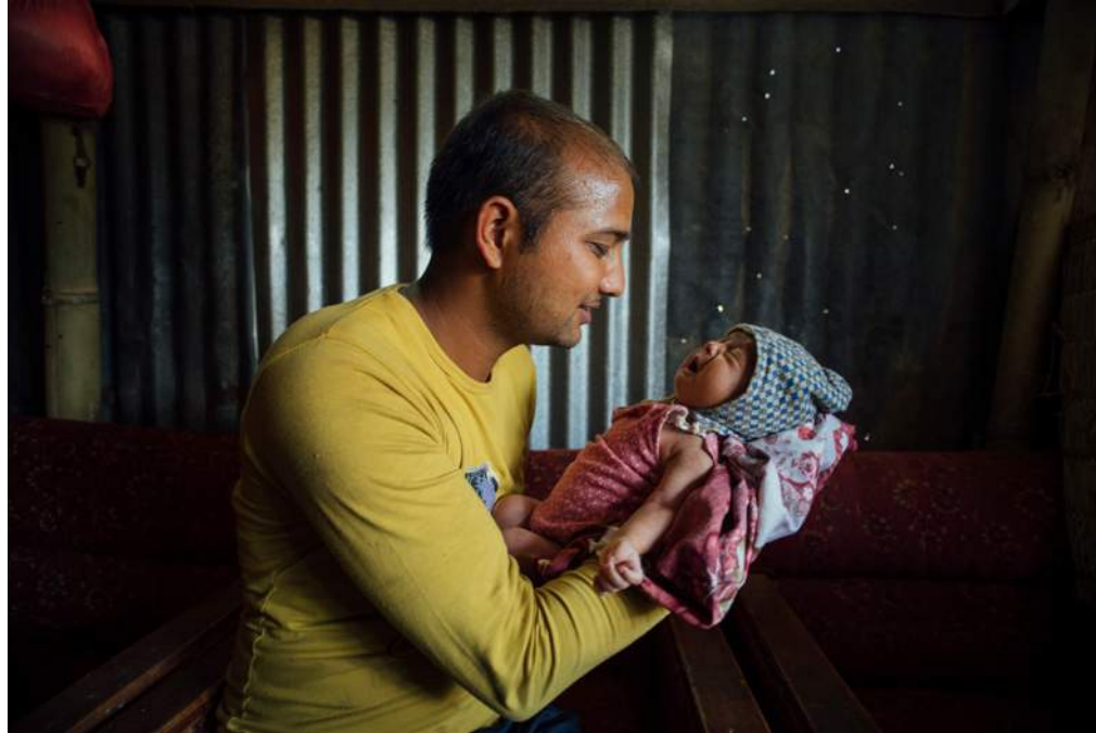
Above: Nepal. Father holds his crying 22-day-old son, in a building in the earthquake-affected town of Singati.

Marriage and family issues may be relegated as social issues and therefore, less of a national priority