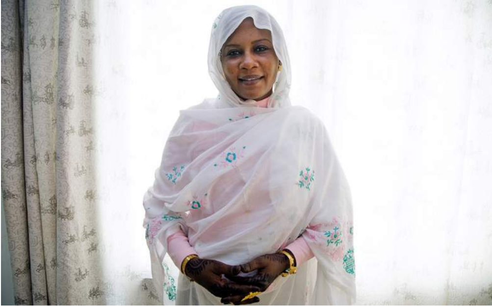
Above: Sudan. Lawyer from Nyala.