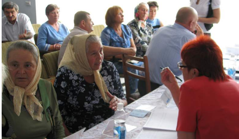
Above: Moldova. Joint Information and Services Bureau representative consults elderly women on their social entitlements in district of Singerei.

Accountability sustains investments made in family law justice institutions and ensures their integrity