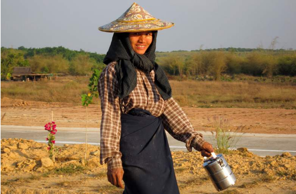
Above: Myanmar. Woman walking home from work along the road from Naypyitaw.