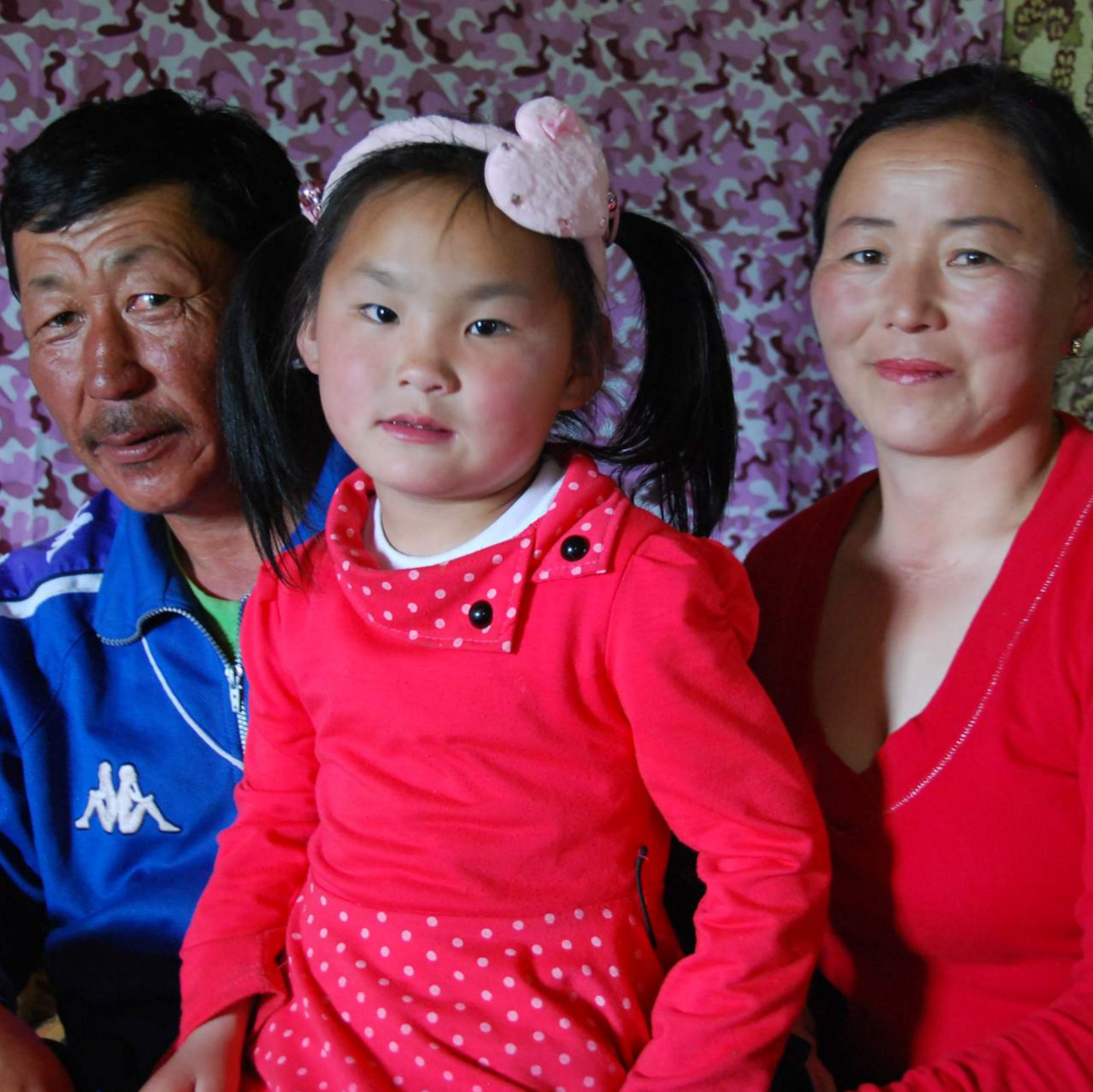
Above: Mongolia. Child and her adoptive parents.