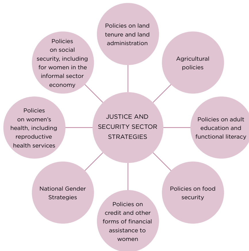
FIGURE 2.1 Protecting women’s property rights through cross-sectoral policy linkages

Marriage, family and property rights cut across different policy domains