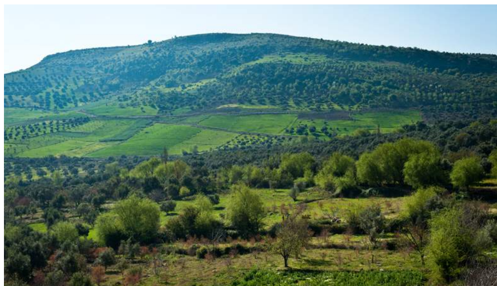
Above: Morocco. The village of Ait Sidi Hsain, near Meknes.

Land tenure security arrangements: A set of interventions by formal State structures or informal community/traditional institutions that seek to protect different types of interests in land that a person may possess. This may include situations where an individual or group of individuals are outright owners through purchase or inheritance from a purchaser; a person who has leased the land for a period of time; a person who enters into a profit or crop sharing arrangement; or a person who has been granted rights of access to land by virtue of being a member of a land-owning family or lineage.