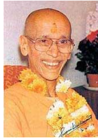
Sri Swami Chidananda

SERVE, LOVE, GIVE, PURIFY, MEDITATE, REALIZE So Says Sri Swami Sivananda