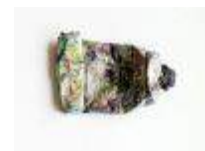
Old paint tube

You may think this will never happen to you. It happens to all of us all the time. You just have to get used to it. My mother was a professional artist for over thirty years. I still have visions of her coming out of her studio with paint up to her elbows, holding a squished up little tube and muttering about only needing an “itty bitty dab of the stuff”. It was when this happened more than three times in a week that we went to the art shop to pick up more paint.