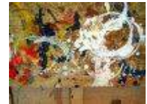
Above are two forms of abstract art.

Accent – Giving exceptional detail to a certain object in the painting to bring attention to it.