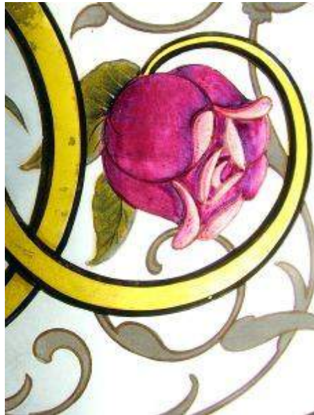
A good example of accenting.

Accent – Giving exceptional detail to a certain object in the painting to bring attention to it.