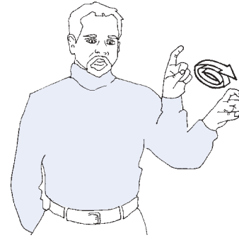
I ask her for a long time

A single ASL sign can express even more. Adding a circular movement to these signs produces signs meaning “I ask her for a long time” and “she asks me for a long time.”