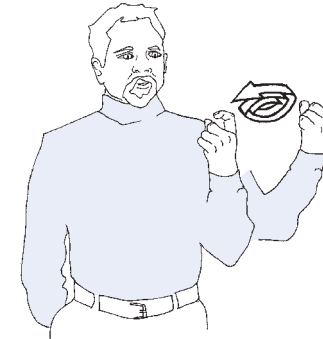
She asks me for a long time

Changing the movement in other ways produces signs meaning “I ask her repeatedly,” “I ask her continually,” “she asks me repeatedly,” “she asks me continually,” and others. These meanings, which English needs four words or more to express, are expressed with only one sign in ASL. ASL has many ways of combining into a single sign complex meanings that can only be expressed with a sequence of words in English. This is one of the many differences between ASL grammar and English grammar. ASL does not lack grammar; it has a grammar of its own that is different from that of English.