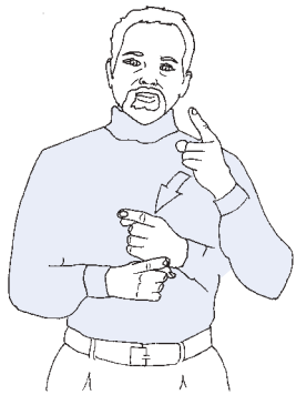
Right (opposite of “wrong”)

Do the signs of American Sign Language (ASL) stand for English words? A simple test is to find English words that have two different meanings. If ASL signs stand for English words, there would be a sign with the same two meanings as the English word. For example, the English word “right” has two meanings: one is the opposite of “wrong,” the other is the opposite of “left.” But there is no ASL sign with these two meanings. They are expressed by two different signs in ASL, just as they are expressed by two different words in French, Spanish, Russian, Japanese, and most other languages.