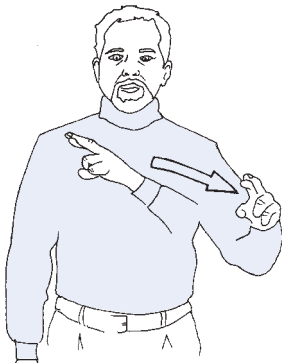
Right (opposite of “left”)

Like the words of other languages, ASL signs express meanings, not English words.