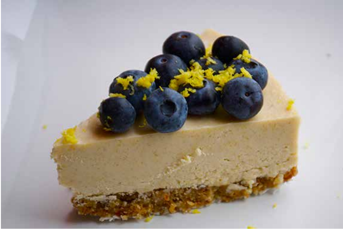
Lemon Blueberry Cheesecake