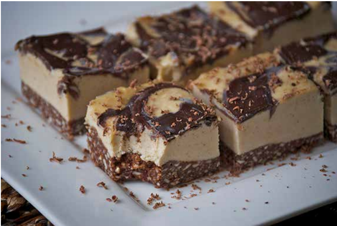
Chocolate Cheesecake Bars