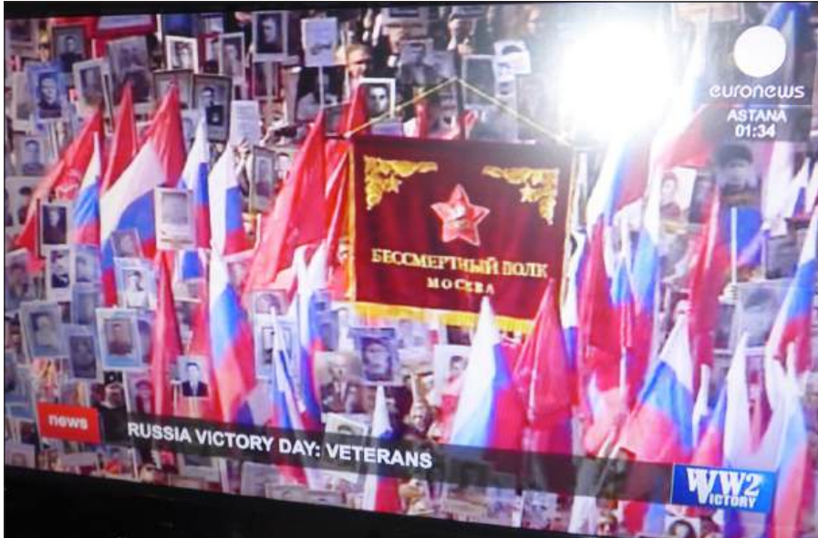
Figure 1. The bessmertnyi polk - Moscow, Red Square, May 9, 2015

Figure 1 illustrates a powerful recent political effort to mobilize the personal family ties into the service of expansion of patriotic unity feelings around the issue of celebrating 70 years from the end of World War 2 in Europe. The history of a war won (or lost) matters – and is made to work for – the future. New generations, carrying the photographs of their deceased relatives who were in the war, join the promotion of the new vigilance of defense of their country in the future. Adding the notion of eternity ( bessmertnyi , immortal) to the collective military unit ( polk , a battalion) carries the affective personal links with one’s relatives forward to future readiness to devote the lives of the young (and their children) to the future political needs of the “fatherland”. Patriotism is promoted in all societies (Carretero 2011) and its function is set up ahead of time when it is needed to achieve concrete political goals. The nature of wars may change in history (Beck 2005; Leach 2000) yet these remain – as von Clausewitz (1908/1832) pointed out in the nineteenth century – a continuation of politics through military means (Roxborough 1994). The wars fought in the courts of law in any country, or between them, are peacetime continuations of the military acts on real battlefields.