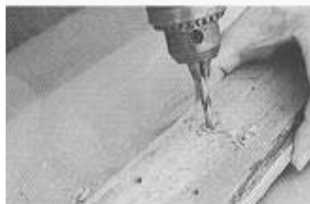
Drilling allows deeper penetration