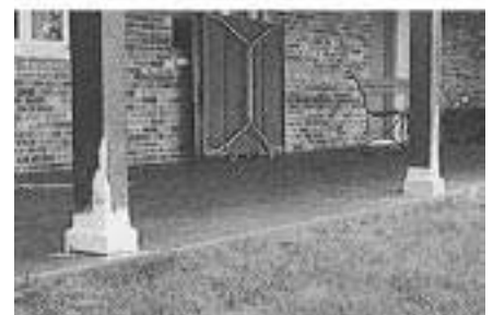
...WoodEpoxy, which outperforms and outlasts wood.