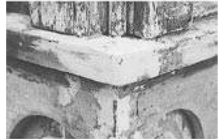
...can be easily and permanently restored...