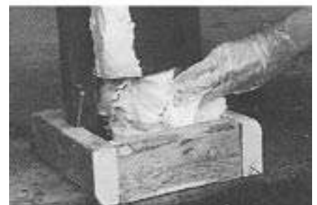
...were completely sawed off and replaced with...