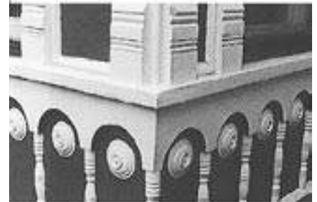
...sanded, nailed, stained, or painted.