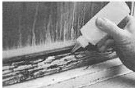
Squeeze bottles are excellent for injecting