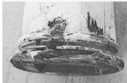
Only LiquidWood plus WoodEpoxy could save this column