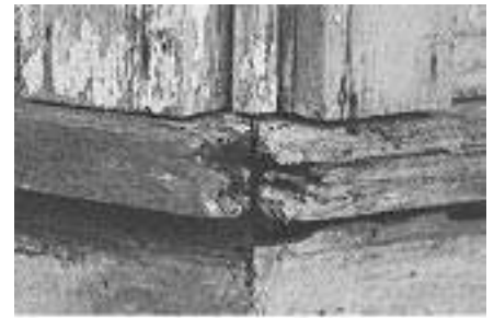
This rotted - and irreplaceable - woodwork...

TYPICAL APPLICATIONS: damaged, cracked or broken windowsills - thresholds - window and door frames - columns - posts - stair steps - railings - balustrades - indoor and outdoor furniture - porches - gazebos - stages - platforms - balconies - countertops - capitals - entablatures - structural and decorative components - walls - mouldings - doors - shutters - artifacts - archeological and art restoration - sculptures - protective filling and resurfacing - models - patterns - mock-ups - handles - knobs - all kinds of shapes.