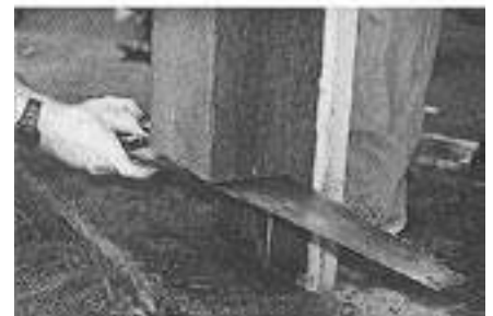
10" rotted bottoms of these load-bearing columns...