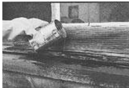
Pouring or brushing is sufficient where absorption is easy

TYPICAL APPLICATIONS: Rotted, dried-out or spongy windowsills - thresholds - window and door frames - columns - posts - stair steps - railings - balustrades - indoor and outdoor furniture - porches - gazebos - stages - platforms - balconies - countertops - cornices - capitals - entablatures - structural and decorative components - walls - mouldings - doors - shutters - artifacts - archeological and art restoration - protective impregnation.