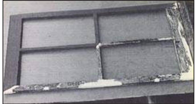
Half was left unpainted to show WoodEpoxy