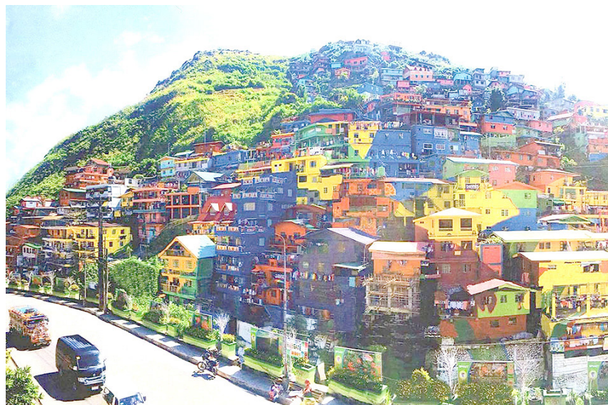
DUH! Regular passersby at Km 3, La Trinidad are now more than pissed as ever on the traffic situation as motorists tend to slowdown trying to "find" the beautiful mural they've seen on TV and newspapers (left photo), as what they see at street level is entirely different (right).