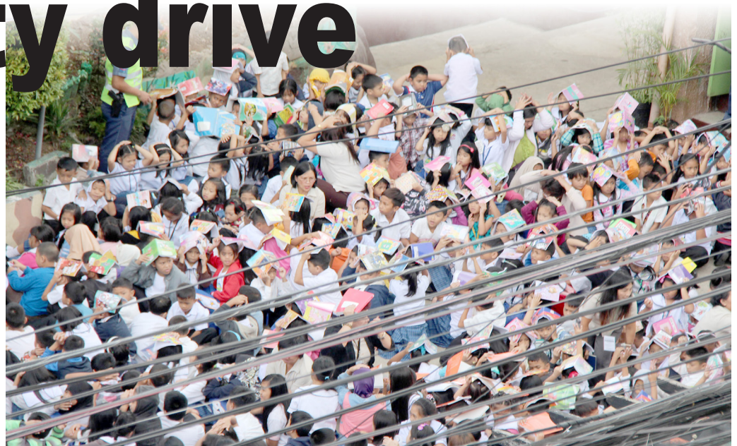
DUCK AND COVER - Doña Josefa Cariño Elementary School pupils and their teachers join the simultaneous national earthquake Drill, June 22.