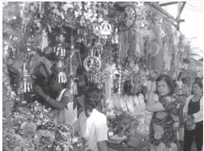
SIGNS OF THE CHIMES- Lanterns and other Christmas decors replace November flowers over at the city market – the only sign that the yuletide season is near even as Filipinos don’t really feel “the spirit” that much anymore because of a generally worsening economic state.