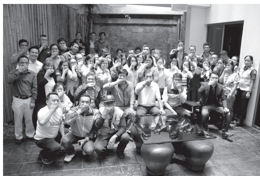
"SMELL NO EVIL" - Members of the SMOKE Free Task Force headed by Mayor Mauricio Domogan cover their nose after a training seminar for the implementation of "The Smoke Free Or Vaping-Free Baguio" otherwise known as City Ordinance Number 34 series of 2017 held at El Cielito Inn.

The members are the chair of the council committee on social services, women and urban poor and committee on youth welfare and sports development, city