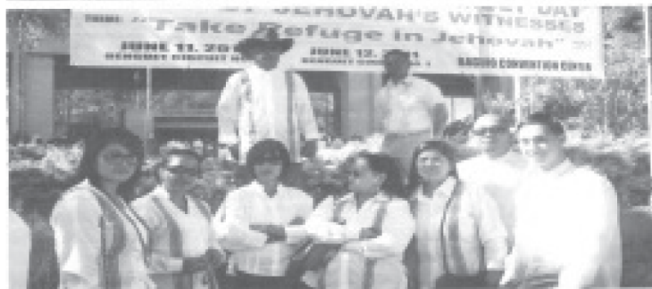
From Palma Urbano Barangay