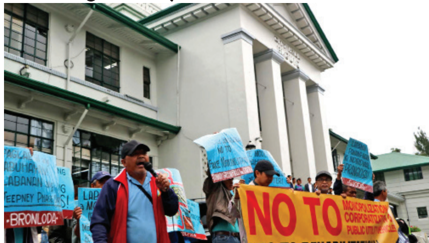
ANTI PUV MODERNIZATION - Baguio public utility vehicle drivers and operators opposes PUV Modernization Plan of the DOTr and LTRFB at the City hall grounds July 30.

"At present, we are trying all means to contain the further spread of the rabies virus in the municipality and I believe with this help of the provincial vet, the regional office, and even you the media, to spread the information that everyone should have to take care of their pets. We can positively contain the spread of the virus," Baldo said. /Liza Agoot (PNA)