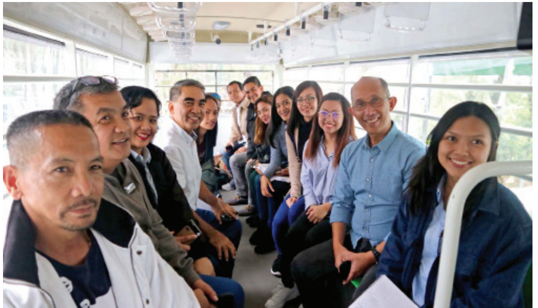
TEST DRIVE - Mayor Benjie Magalong joins the Modern PUV Caravan while threshing out the issues and concerns during an open forum with public utility vehicle drivers and operators where some are oppose the PUV Modernization program of the DOTr and LTRFB.

Further, the assistance shall be Cont. on page 3