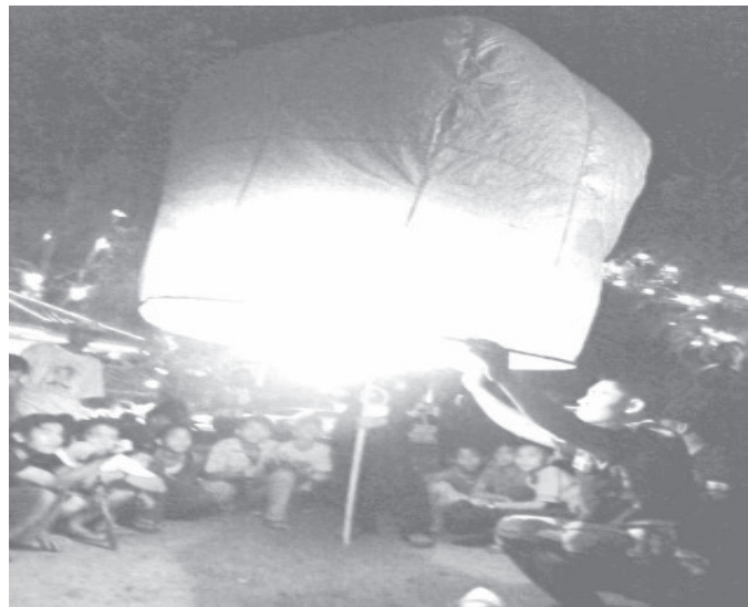
HOT AIR BALLOON. A hot air balloonist in Estancia, Iloilo prepares to let fly his small hot air balloon while children gather around him looking in amazement what kind of a balloon that is.