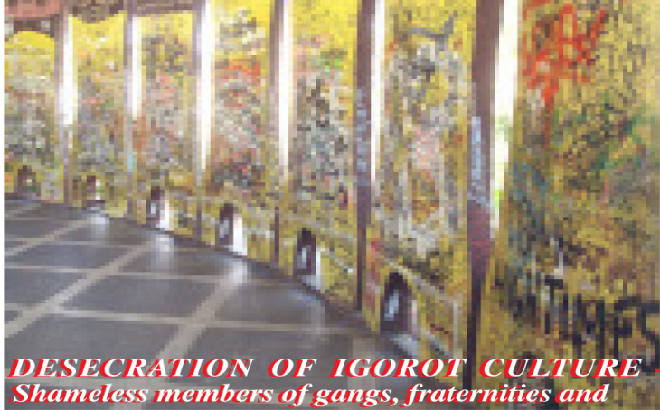
DESECRATION OF IGOROT CULTURE Shameless members of gangs, fraternities and

individuals vandalized the "Kalasag" at Sunshine Park representing the seven provinces of the Cordillera Administrative Region's logo featuring its great tradition, arts and culture.