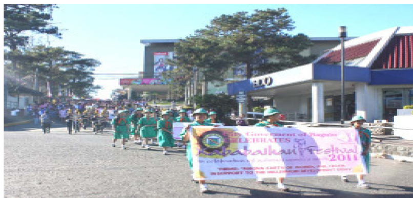
"WOMEN'S DAY" – thousands participate in the Kababaihan Festival spearheaded by the City Government of Baguio last March 8 as part of the Women's Month celebration./ Photo by paul rillorta

This back-to-basics training is a continuing activity. Other police stations will soon conduct the training for their respective personnel, he added. /Mari Cruz/PIA-CAR