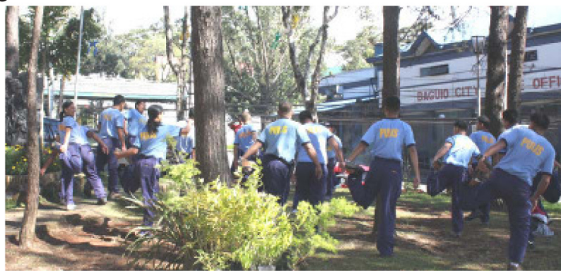
"LET'S GET PHYSICAL" – members of the Baguio's Finest enjoy the early morning sun while keeping themselves physically fit during routine exercises in front of city hall.