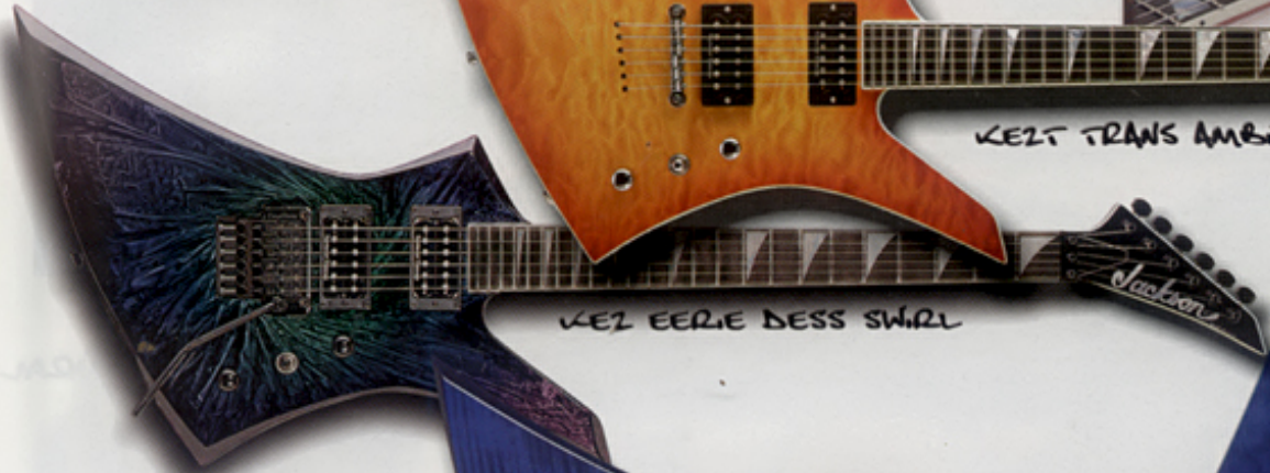
KE2 EERIE DESS SWIRL