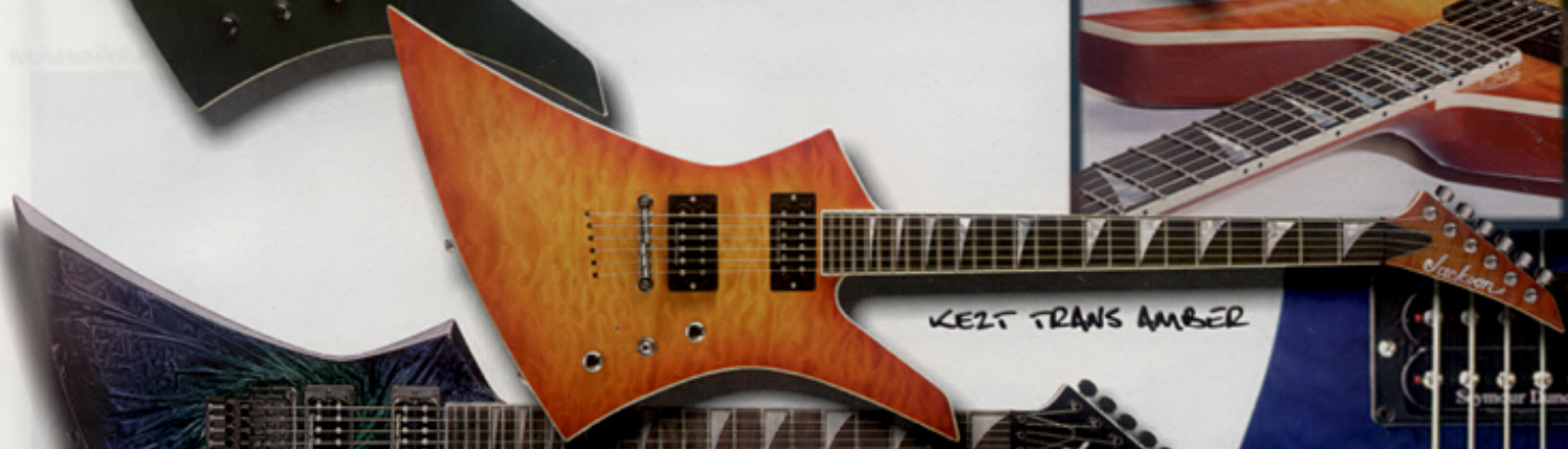
KE2 TRANS AMBER