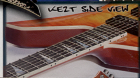
KE2 SIDE VIEW