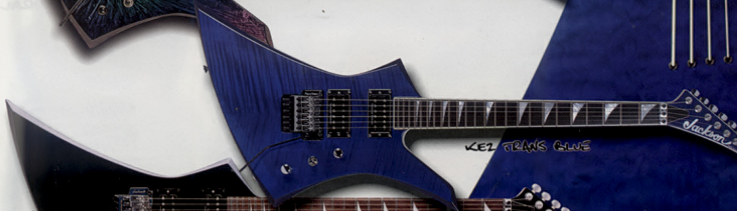
KE2 TRANS BLUE