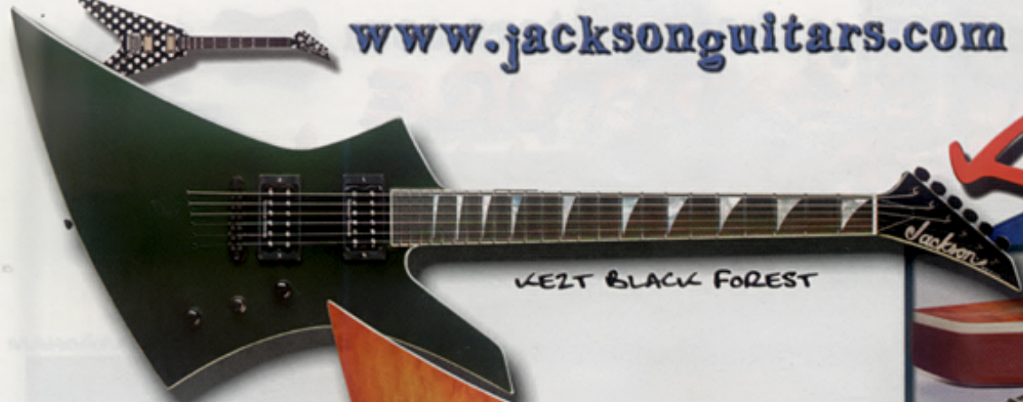
KE2 BLACK FOREST