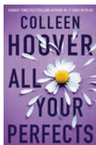
All Your Perfects