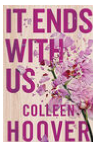
It Ends With Us