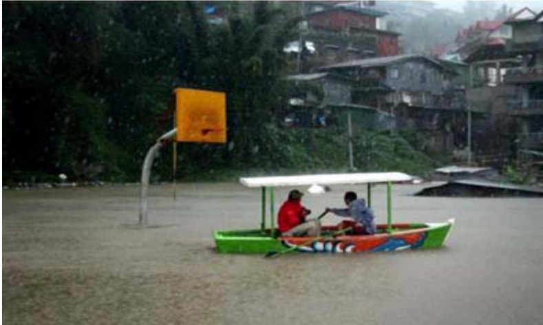
WHERE DID THE P54 MILLION CITY CAMP LAGOON DRAINAGE FUND GO? IT WAS USED TO EXPAND BURNHAM LAKE FOR BOATING.

BAGUIO CITY – The city’s position on the segregation of the entire land area covered by the 13 barangays from the Camp John Hay reservation is non-negotiable, Mayor Mauricio Domogan said on Wednesday.