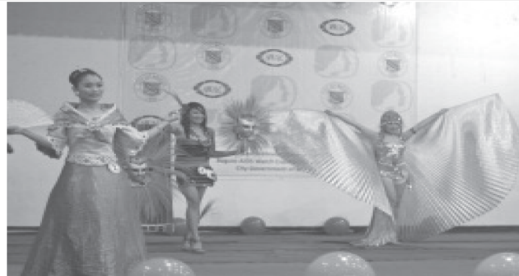
“WORLD CLASS” – contestants of the Baguio Association of Restaurants and Bars (BARS) beauty contests wearing beautiful costumes highlights the celebration of the World Aids Day in the city last December 2 at the Baguio Convention Center.

The PDEA occasionally conducts ceremonial burning of dangerous drugs to clearly show the public where such millions worth of confiscated prohibited drugs go.