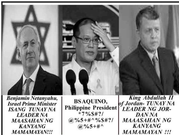
Benjamin Netanyahu, Israel Prime Minister ISANG TUNAY NA LEADER NA MAASAHAN NG KANYANG MAMAMAYAN!!!