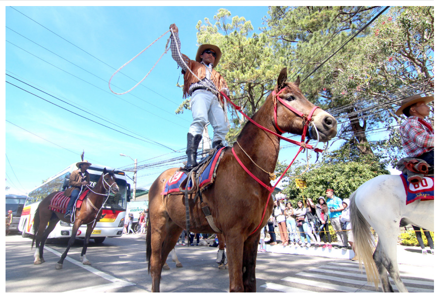
A Baguio Cowboy shows his lasso and horseback riding skills to the delight of the crowd and the Miss Universe candidates during the Mini-Panagbenga Parade last January 18.

Pag-IBIG I savings which are part of housing loan amortizations are excluded from the raffle used in the remittance /JDP/MAWC-PIA CAR#