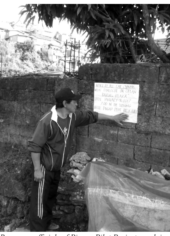
Barangay officials of Pinsao Pilot Project are doing their share in informing car owners about the Anti obstruction ordinance of the city government which involve barangay roads.