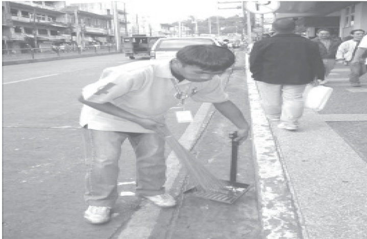
LONESOME JOE - An unidentified city hall employee does a road sweep along Abanao during a massive cleanup drive by city employees dubbed "Operation Panagdalos."

Sen. Chiz Escudero said one must be careful when reading government figures on the Philippine jobless rate which can be deceiving.