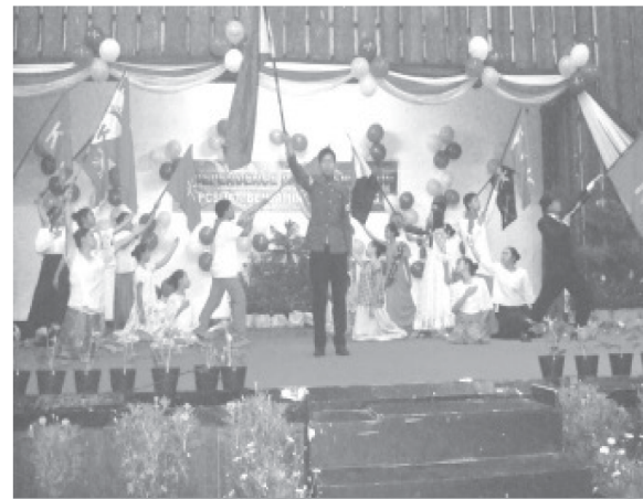
THROUGH BLOOD AND TEARS - Members of the Baguio City National High School Special Program for the Arts present an interpretative number on how our forefathers fought and died for the independence of our country during the 114th Independence Day Celebration held at Baguio Convention Center June 12.