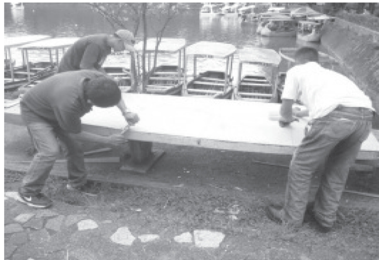
PIX 6236: BOAT YARD - A concessionaire and his helpers repair and paint their boat for hire at Burnham Lake this lean season in preparation for the influx of tourists and park goers after the rainy season.