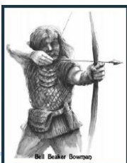
Illustration from David Reich's NW Bell Beakers