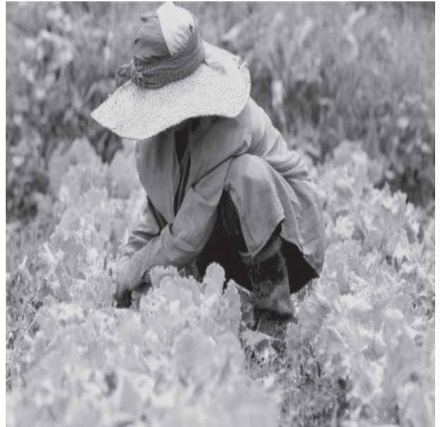
La Trinidad, Benguet --A daunting task on an chilly early morning for this woman Benguet vegetable grower tending her lettuce at the vast vegetable farms along the valley here, is a classic example of Filipinos pliant behaviour towards adversities including typhoons that ravaged vegetable farms here. But still, life has to continue even after the storm.-Ace Alegre