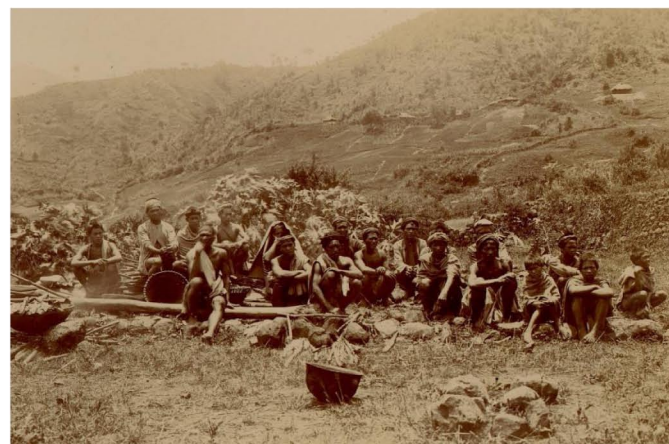
Igorot group in Buguias Benguet, 1901. Copper kettle is made by Igorots mined and smelted by them.