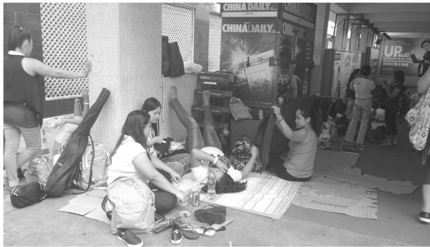
OFWs in Hongkong on their Sunday day off.