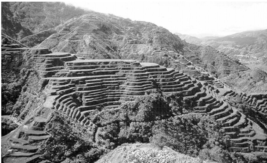
Igorot rice terraces