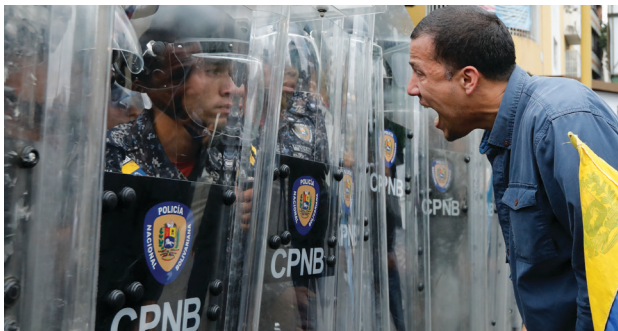
A protester yells at police blocking an opposition march in Caracas, Venezuela, on March 10, 2020.