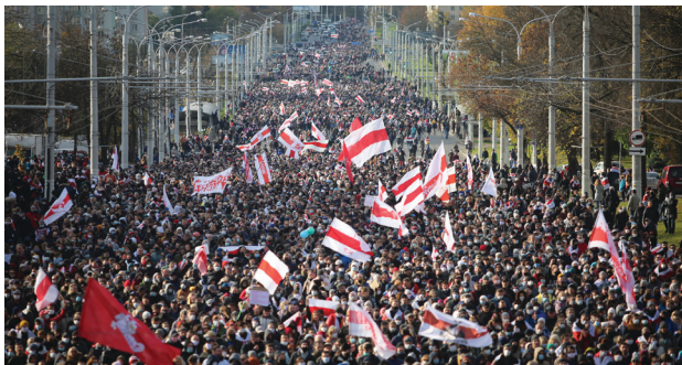
People with old Belarusian flags march at an opposition rally to protest official presidential election results in Minsk, Belarus, on October 18, 2020.

confrontation in the South China Sea that involves U.S and Chinese forces dropped from a Tier I to a Tier II concern. Of the thirty contingencies identified in this year's survey, this was the only one judged to have a low likelihood of occurring in the coming year.