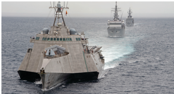
The combat ship USS Gabrielle Giffords exercises with Japan Maritime Self-Defense Force training ships, on June 23, 2020.