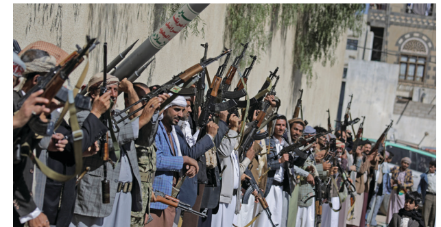
Fighters hold their weapons during a gathering aimed at mobilizing more support for the Houthi rebel forces in Sanaa, Yemen, on February 25, 2020.