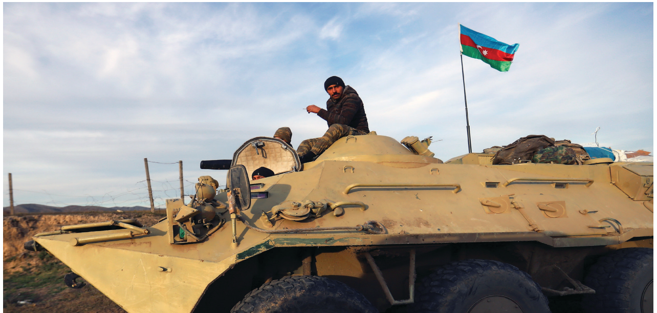
Azerbaijani troops drive an armored vehicle in the Nagorno-Karabakh region, on November 25, 2020.

With these imperatives in mind, the Center for Preventive Action (CPA) at the Council on Foreign Relations has surveyed American foreign policy experts every year since 2008 to ascertain which sources of instability and conflict warrant the most concern for the coming year. Each respondent is asked to assess the likelihood and potential impact on U.S. interests of thirty contingencies identified in an earlier public solicitation (see methodology, page 4). These events or series of events were judged to be plausible over the next twelve months—a timeframe that permits more confident forecasting and allows time for a meaningful policy response. The results are then aggregated and the contingencies sorted into three tiers of relative priority for preventive action.