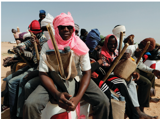
Nigerien citizens wait for army soldiers to escort them through the desert on their journey north toward Libya, on the outskirts of Agadez, Niger, on October 29, 2019.

Although future events are inherently unpredictable, the United States is not hostage to fate. The likelihood of specific contingencies occurring is calculable from the presence of known risk factors. Precautionary measures can be directed toward those that appear most threatening to lessen the chance that they materialize and reduce the harmful impact if they do. Because some contingencies clearly pose a greater threat to U.S. interests than others, both preventive and preparatory efforts should be apportioned accordingly. Busy policymakers have limited bandwidth to focus on the future when managing the present and thus need to prioritize their attention and resources.