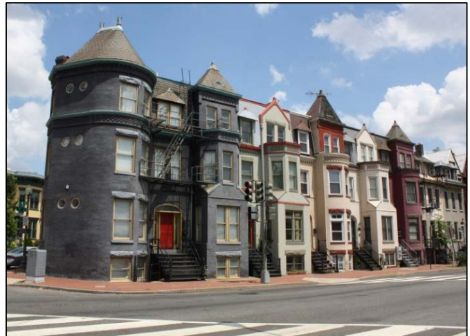
547-539 Florida Ave, NW, example of Barr & Sanner row-house development, 1889. Photo by EHT Traceries, July 2012.

Barr & Sanner went their separate ways around 1900 and Barr continued as an independent builder, forming one of Washington's most successful development companies. While assisting in the development of Kalorama Triangle, Barr began work on the Wyoming Apartments, located at the corner of Columbia Road, Wyoming Avenue, and 19 th Streets, N.W., in 1905. Listed in the National Register of Historic Places, the seven-story luxury apartment building is an example of the "Golden Age" of pre-World War I development. The buff-brick Beaux-Arts building was constructed in three separate phases to the designs of B. Stanley Simmons. At the time of its completion, the Wyoming was one of the largest apartment complexes in the City. With large