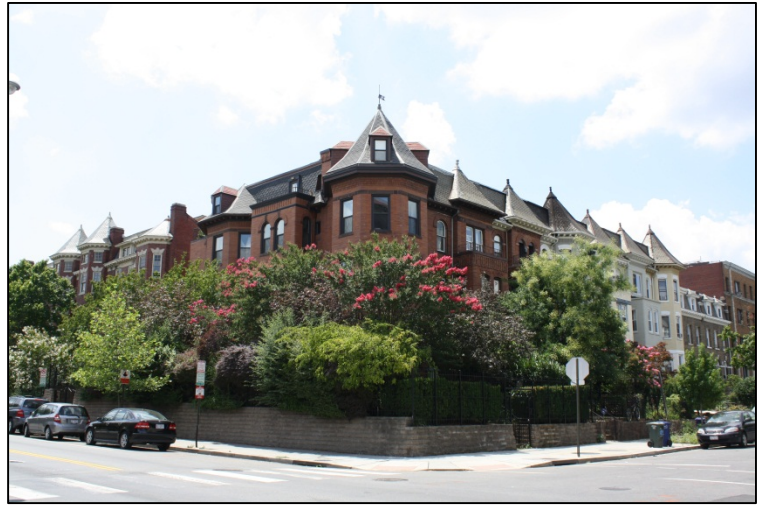
13 th and Fairmont Streets, NW.