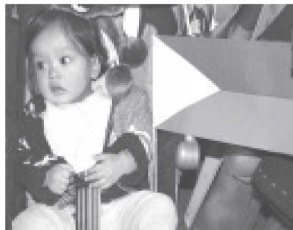
BORN FREE - A baby girl with a Philippine Flag on her stroller joins her parents to celebrate the 116th Philippine Independence Day held at the Baguio Convention Center June 12.