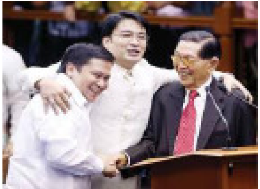
The three (3) soon to be detained Philippine Senators accused of Plunder and Graft and Corrupt Practices.