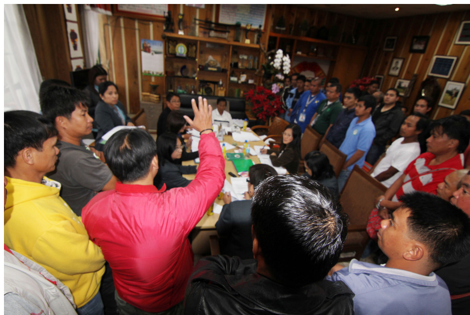
VACANCIES - More jobseekers apply for vacant positions at City Hall. The applicants are screened by the Personnel Evaluation Board headed by Mayor Mauricio Domogan. / By Bong Cayabyab