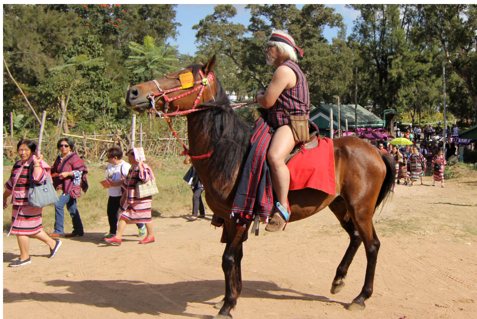
IBALOI DAY - An Ibaloi elder on horseback watches as tribesmen representing their respective municipalities in Baguio and Benguet Province during the 7th Ibaloi Day celebration.