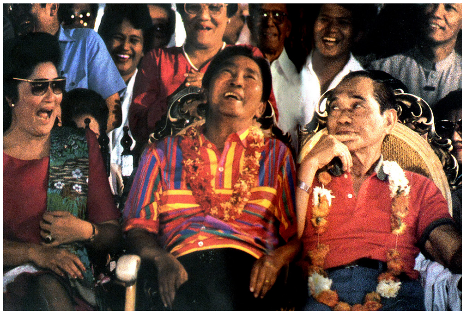
GOOD TIMES. The Marcos couple with vice presidential candidate Arturo Tolentino as they open their campaign for the 1986 snap elections.

MANILA, Philippines — When Ferdinand “Bongbong” Marcos Jr. was 26, living in Hawaii after his father was deposed by a people power rebellion in February 1986, a first-hand account shows that he was privy to the Marcos deposits in the Swiss banks, particularly Credit Suisse. It is not clear if he knew the amounts involved but these were estimated at $10 to $20 billion, alleged to have been illicit wealth. Part of this has since been transferred to the Philippine government.