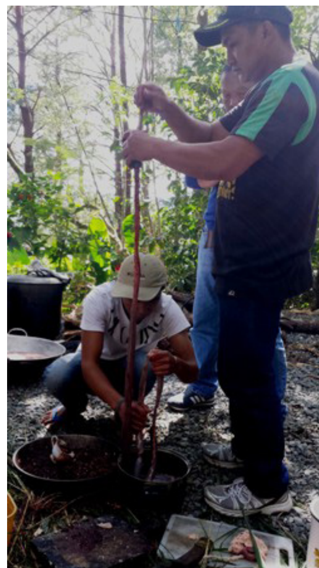
A young Ibaloi of Benguet prepares a native food called "pinuneg", the Cordillera version of blood sausage, which is made up of pig's blood, large intestine, and spices

She finished here statements by asking the teachers and students to use the facilities well and to care for it for the future generations.