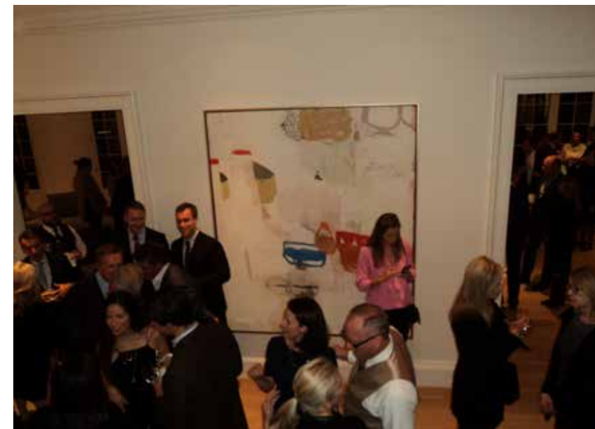
3030 Chain Bridge Rd. Preview Party