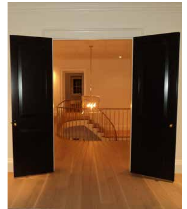
Exquisite brass railings