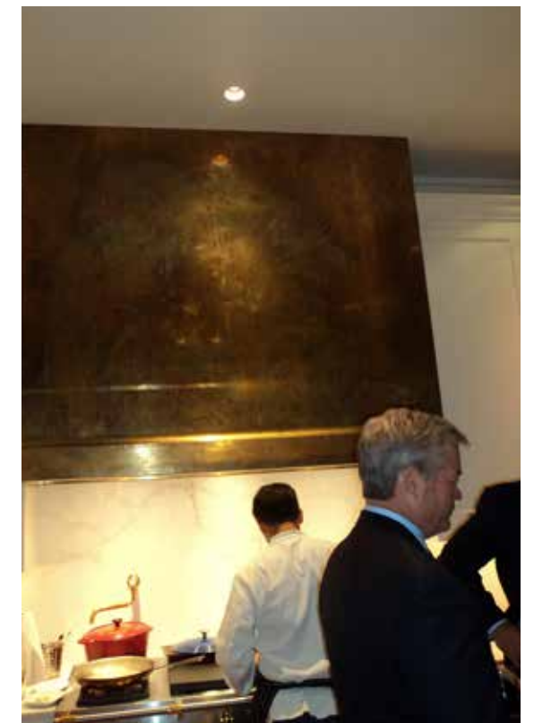
Exquisite brass hood over stove

were used – the same stone found in the Empire State Building and the Washington National Cathedral. Metal workers, who worked in the Cartier Mansion in Manhattan completed brass railings and other magnificent features, including the beautiful brass hood over the kitchen stove.