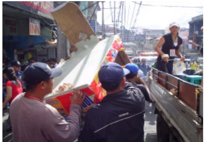
CONFISCATED - Members of the Public order and Safety Division confiscate a movable stall obstructing the passageways while others remove unsightly tarpaulins (Pix 025) during a massive clearing operation at the City Market last September 9./By Bong Cayabyab

The measure will be discussed on second reading soon./ Aileen P. Refuerzo