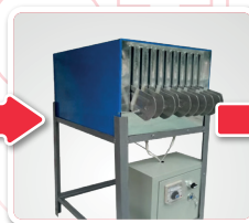
Sock Boarding Machine