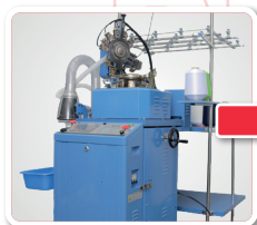
Sock Knitting Machine