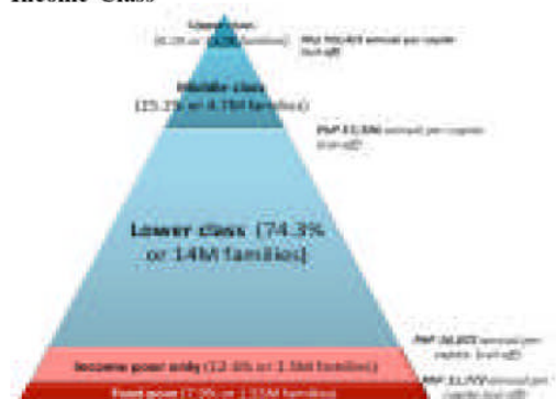
Figure 1. Filipino Families Disaggregated by Income Class

experts still debate the exact figures due to well-known non- or under-reporting of incomes by some survey respondents (notably the very rich), most would agree that the figures above are likely to underestimate the true degree of inequality in the country.