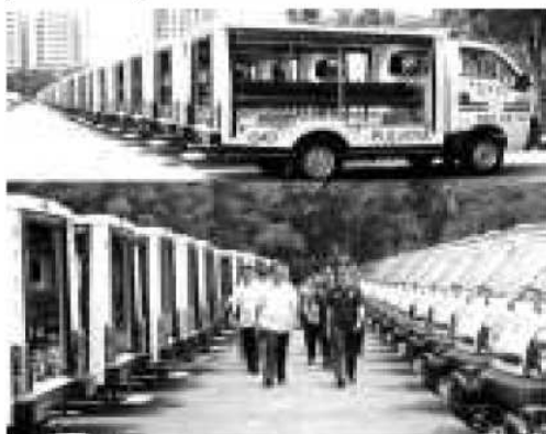
OVER PRICED BY 150 Million PESOS PNP VEHICLES- The alleged over priced PNP Vehicles./ http://thephpride.blogspot.com/2015/05/pnp-buys-overpriced-patrol-jeeps.html