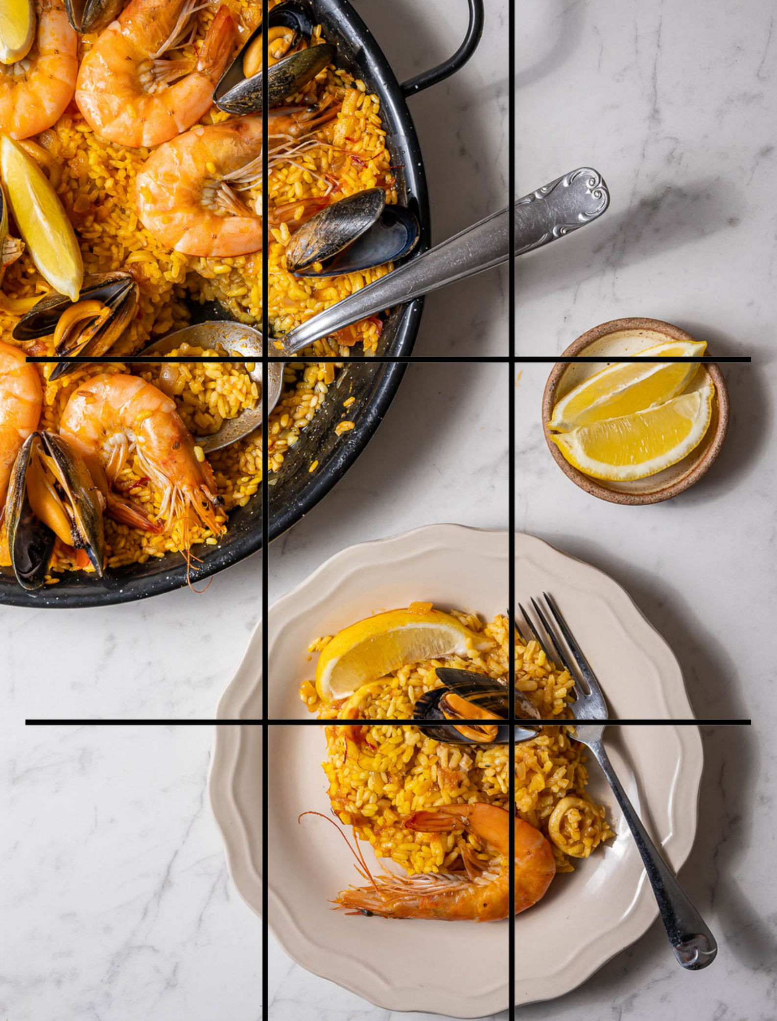
Rule of thirds