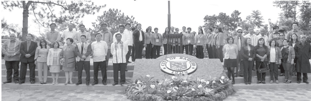
MARCHING ON - Baguio's new set of government officials and department heads join the City Hall Choir for the singing of Baguio March during City Hall flag raising ceremonies July 4.m/ By Bong Cayabyab

Tubera added the dengue fever and the more severe form, dengue hemorrhagic fever, is caused by an infected day-biting female Aedes mosquito which transmits the viral disease to humans./ PNA/PGL/JOJO LAMARIA