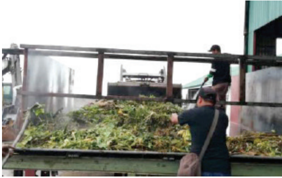
BIODEGRADABLE WASTES. A worker at the city's Environment Recycling System situated at the former Irisan dumpsite applies a 'deodorizer' to the biodegradable wastes from the city market for conversion to compost fertilizer. The city will soon require all

households and establishments to compost their own biodegradable wastes as required under the ecological solid waste management law.